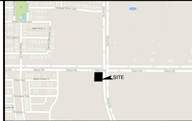
2 VICINITY MAP SCALE: NTS NORTH