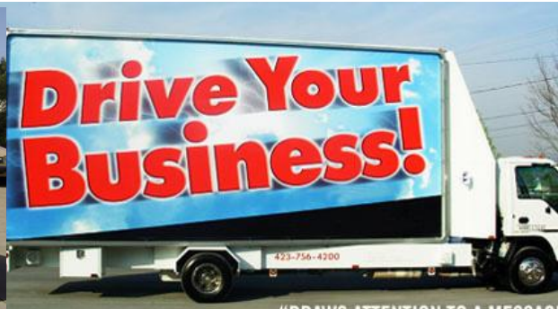
"DRAWS ATTENTION TO A MESSAGE BRINGING IT DIRECTLY TO THE CONSUMER"