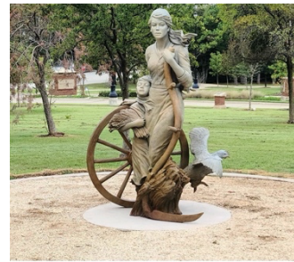
Liked by 813594 and others schaeferartbronze "Prairie Winds" -Seth Vandable Installed at Bicentennial Park, Southlake