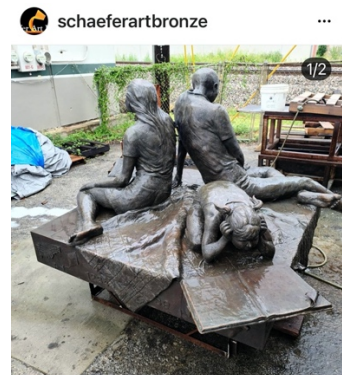
schaeferartbronze ... Liked by 813594 and others schaeferartbronze Working on a restoration for @eulesslibrary