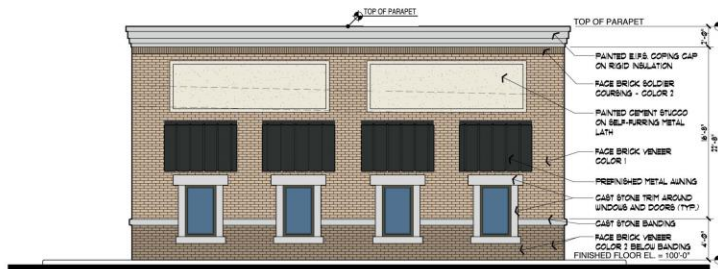
③ NORTH ELEVATION SCALE: 3/16" = 1'-0" EXT-EL01.DWG