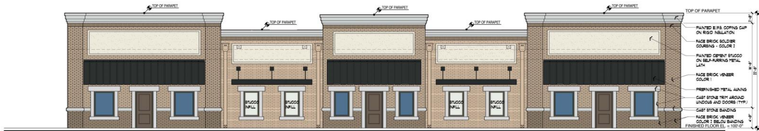
④ WEST ELEVATION SCALE: 3/16" = 1'-0" EXT-EL01.DWG