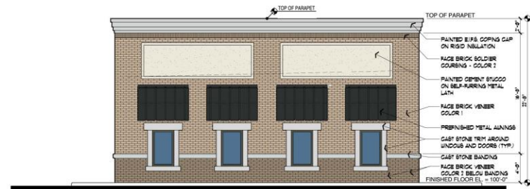
② SOUTH ELEVATION SCALE: 3/16" = 1'-0" EXT-EL01.DWG