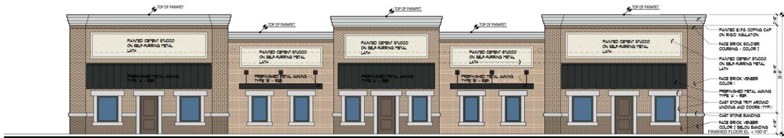
① EAST (FRONT) ELEVATION SCALE: 3/16" = 1'-0" EXT-EL01.DWG