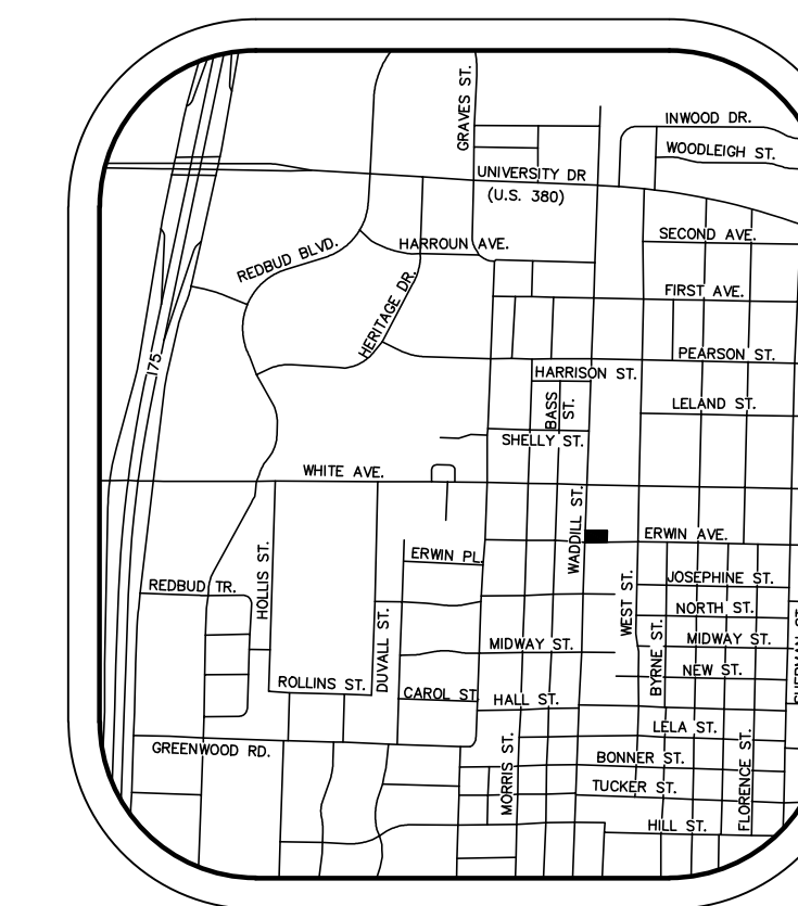
VICINITY MAP NTS