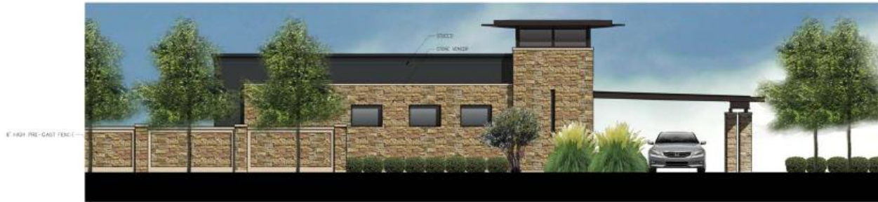
2 SOUTH ELEVATION SAM RAYBURN TOLLWAY SCALE: 3/16" = 1'-0"