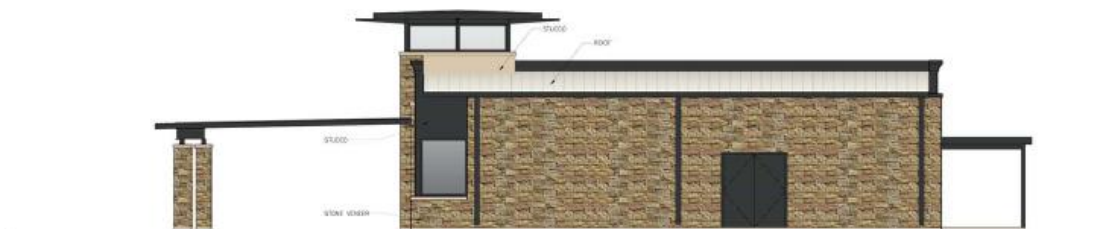
4 NORTH ELEVATION SCALE: 3/16" = 1'-0"

SCHEMATIC DESIGN REVIEW NOT FOR REGULATOR APPROVAL, PERMITTING, OR CONSTRUCTION