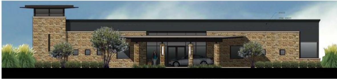
1 EAST ELEVATION SCALE: 3/16" = 1'-0"