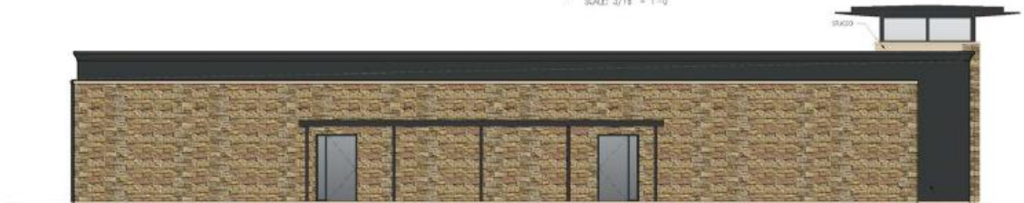
3 WEST ELEVATION SCALE: 3/16" = 1'-0"