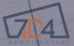
The Project: Expansion Poster