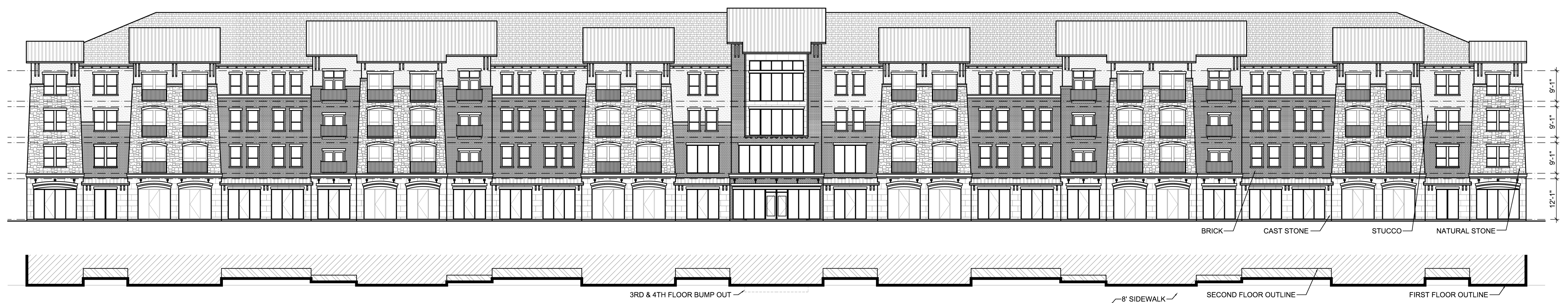
01 EXTERIOR FRONT ELEVATION 1/16" = 1'-0"