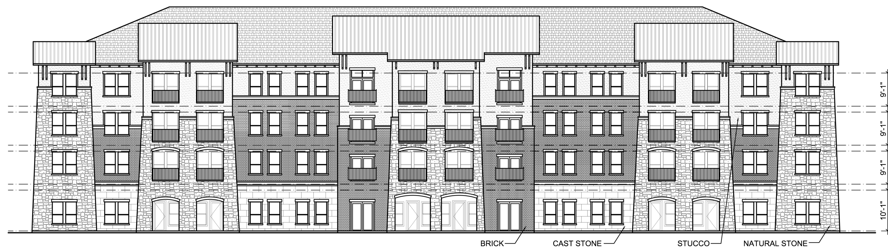
02 EXTERIOR SIDE ELEVATION 1/16" = 1'-0"