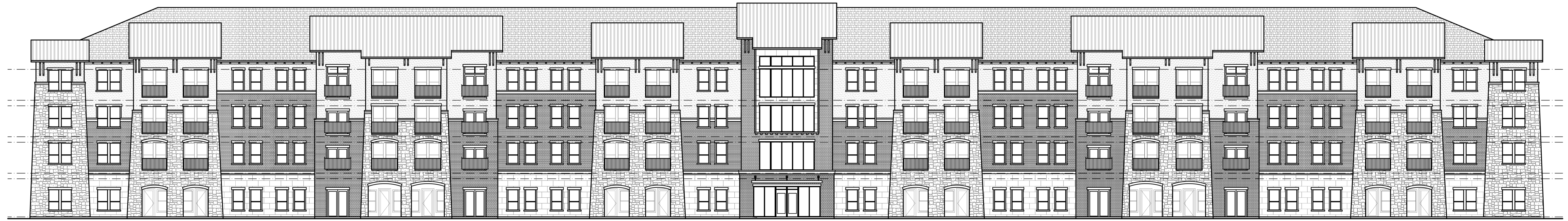
04 EXTERIOR REAR ELEVATION 1/16" = 1'-0"