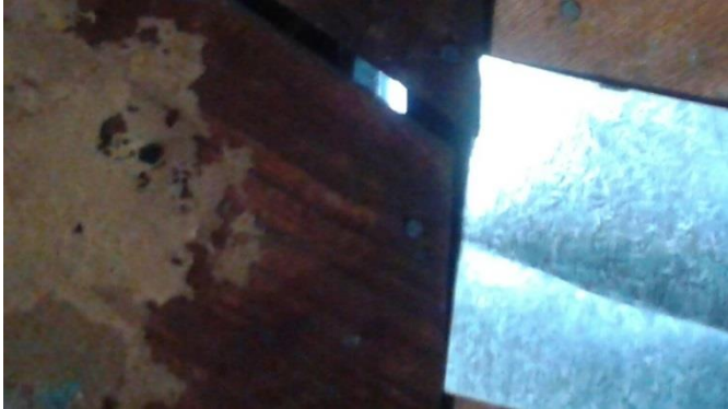
Hole in attic Ceiling/Roof