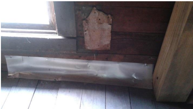
"Band-aid" attic repair