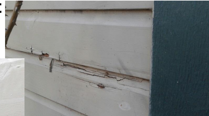
Wood rot & peeling paint from sprinkler head design