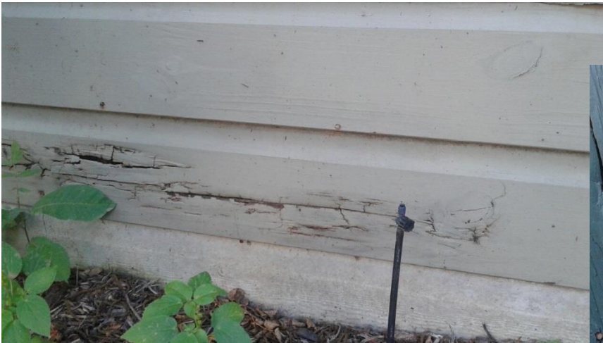
Damage from sprinkler head placement/design