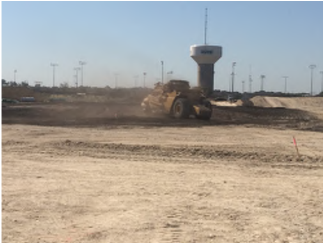
Site Grading in the Parking Lots