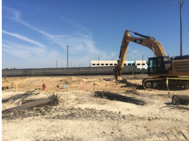
Site Utilities Being Installed