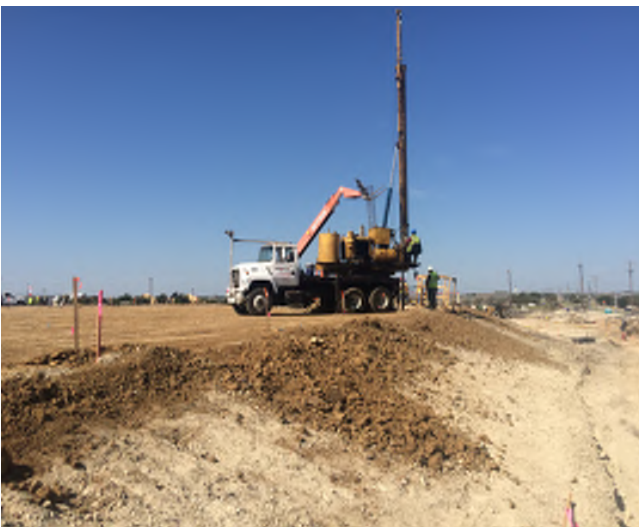
Pier Drilling in Progress