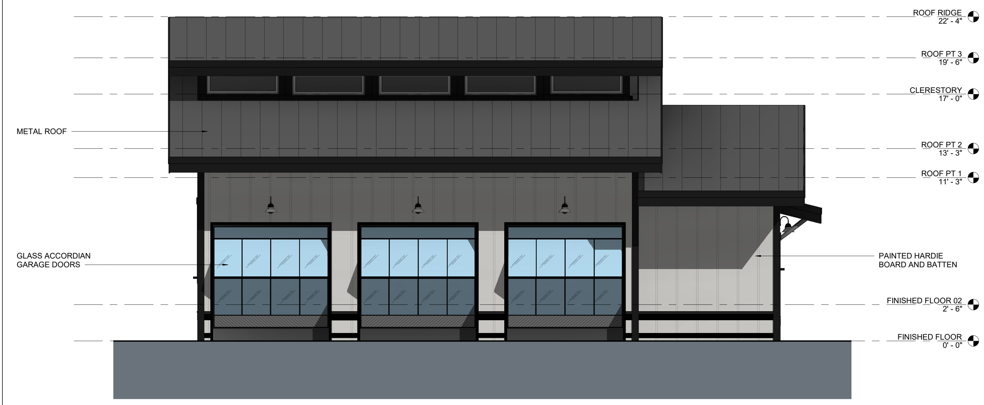
2 NORTH ELEVATION 1/4" = 1'-0"