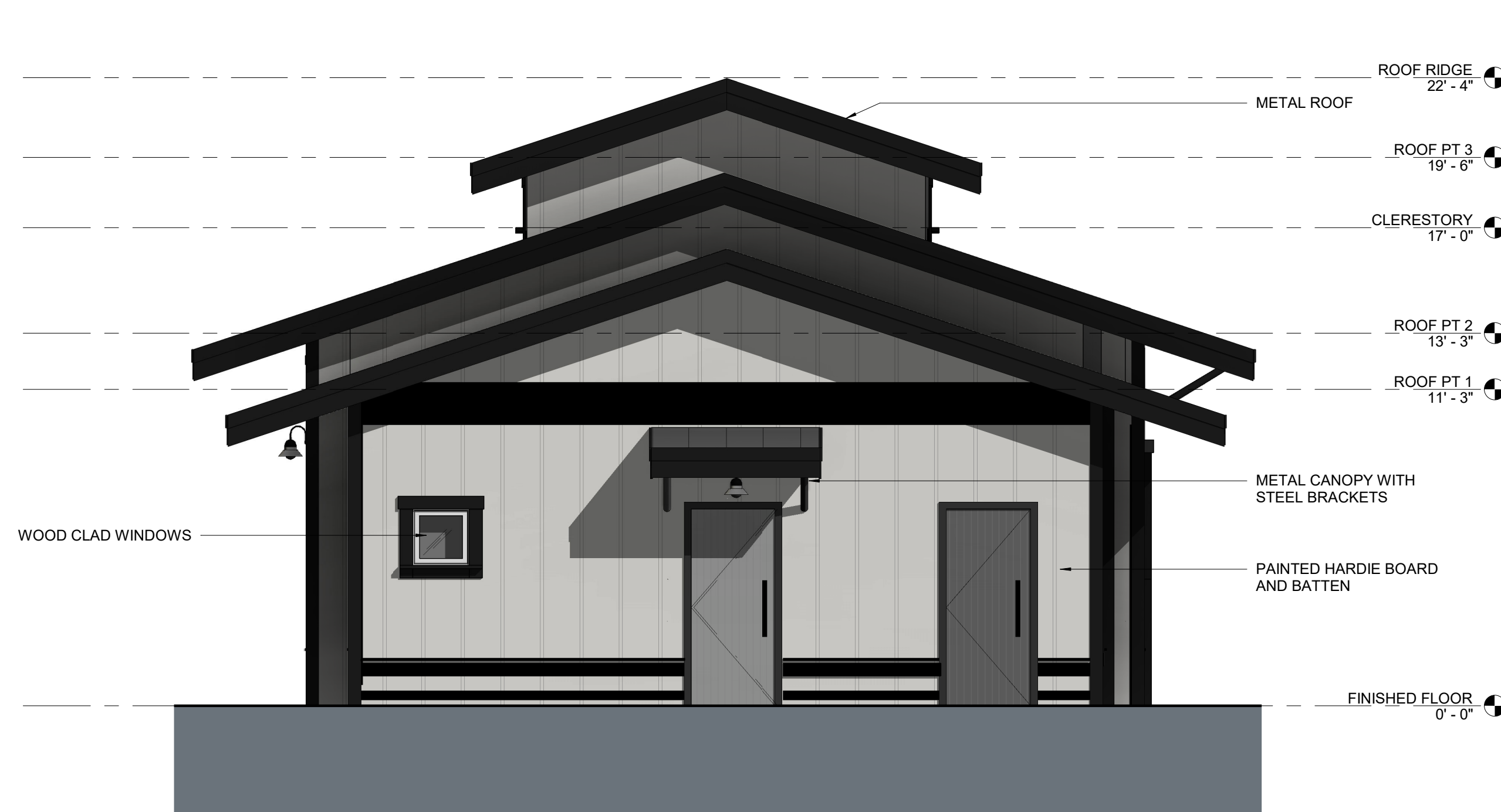
4 WEST ELEVATION 1/4" = 1'-0"