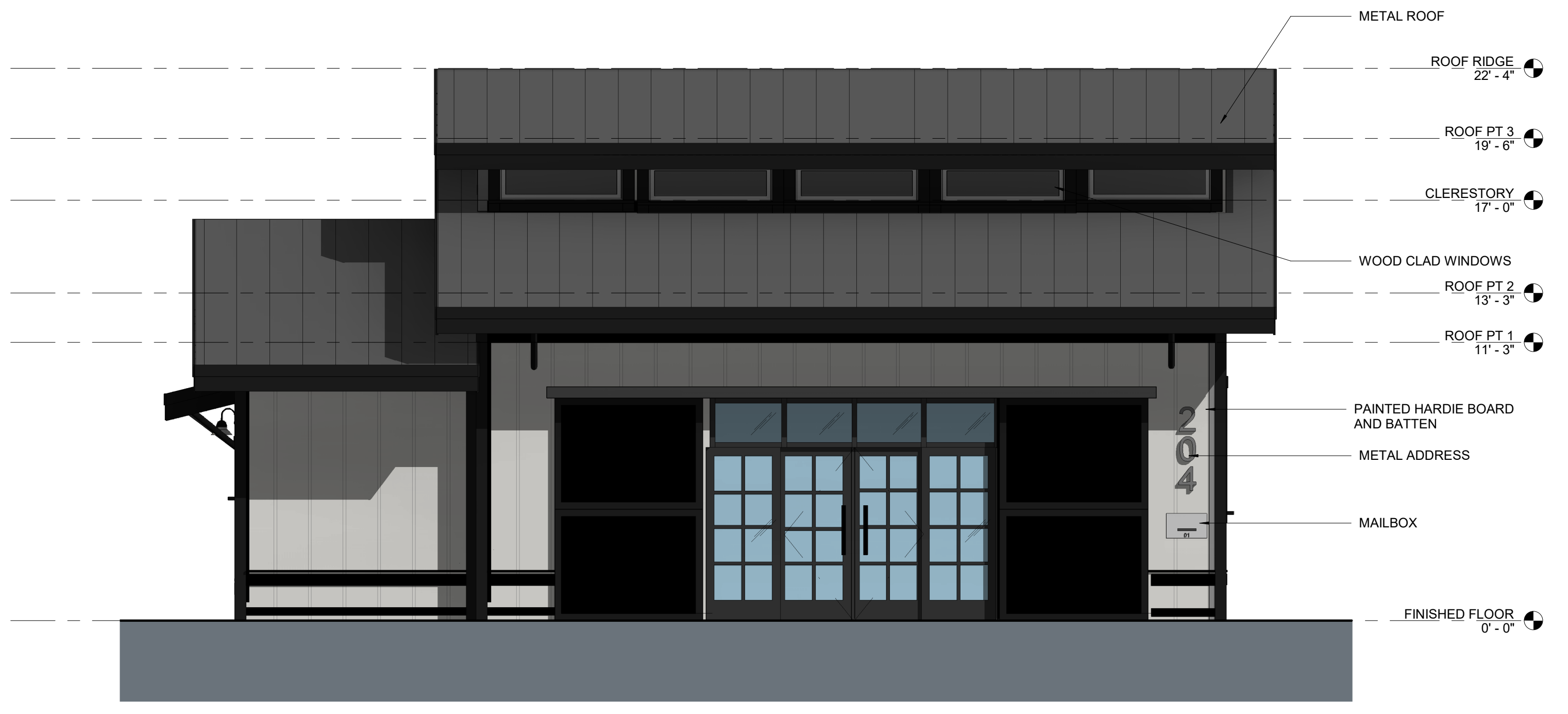
3 SOUTH ELEVATION 1/4" = 1'-0"