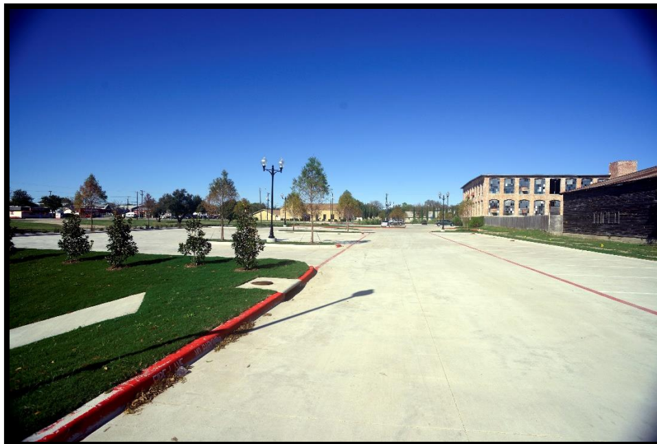
Town Center TIRZ 1 (Completion of Cotton Mill parking lot construction)

The adopted Town Center Study calls for the preservation of the Historic Core with enhancements for an eventual Transit Village around the proposed rail transit station.