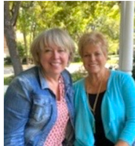
Garden Club Presidents

Garden Club expansion plans Landscape jobs Audio Company jobs Brickwork jobs Added luncheon space