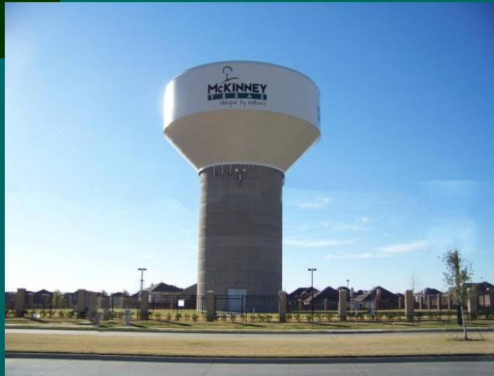
Representative photo – Independence Pkwy Elevated Storage Tank

Construction Cost: $4.5 Million (estimated)