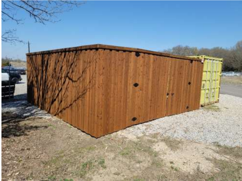
Figure 4. Exterior of shipping container and fenced area where the mower will be securely stored.