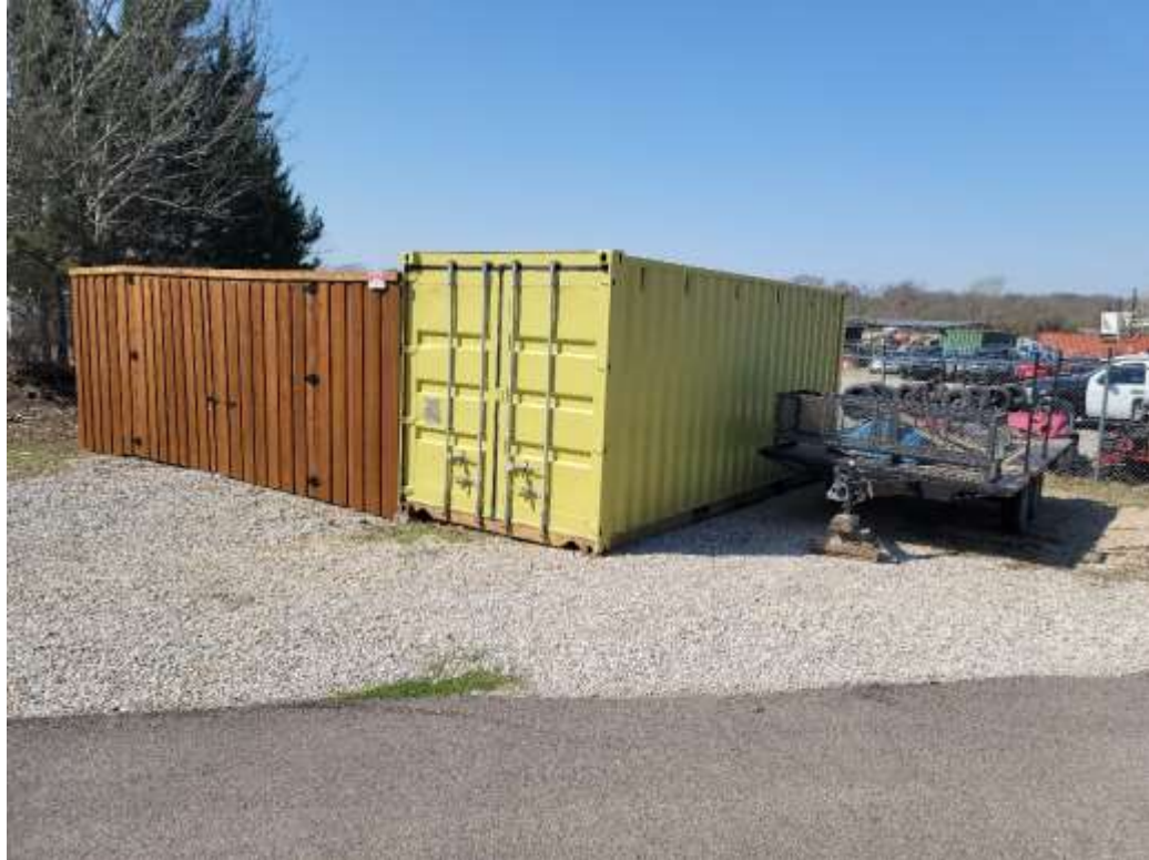
Figure 3. Exterior of shipping container and fenced area where the mower will be securely stored.