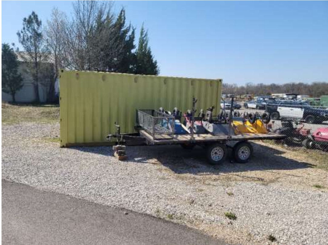
Figure 5. Exterior of shipping container and fenced area where the mower will be securely stored.