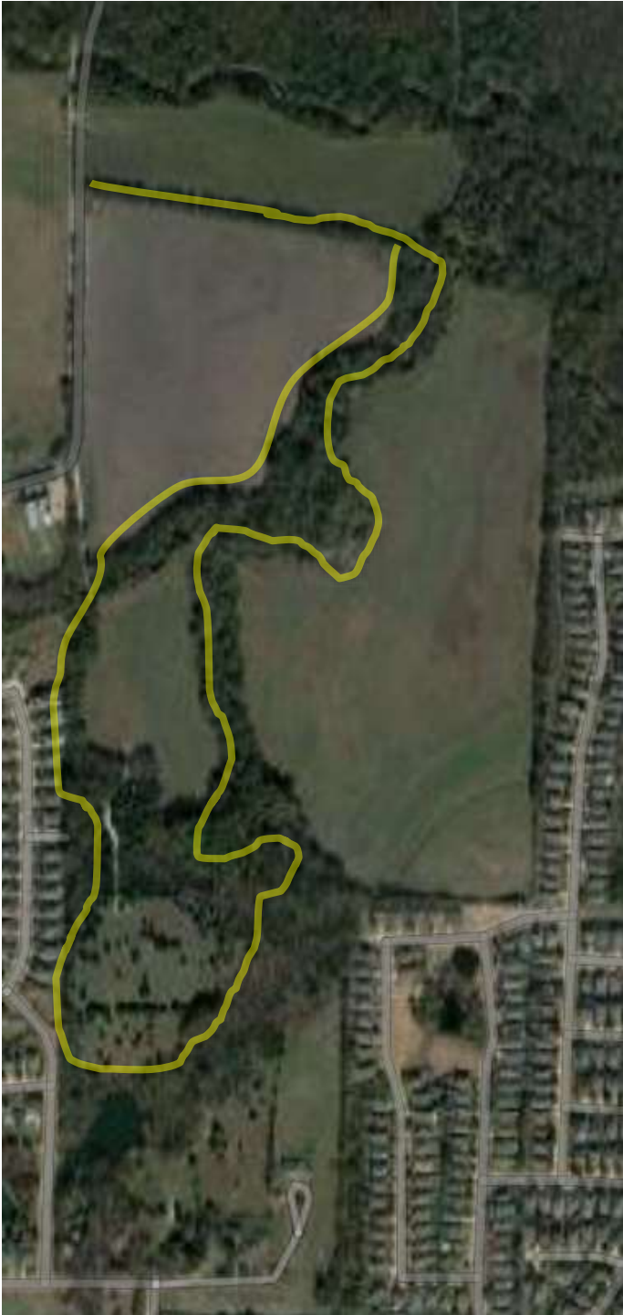
Figure 3. Gray Branch Park trail proposed design