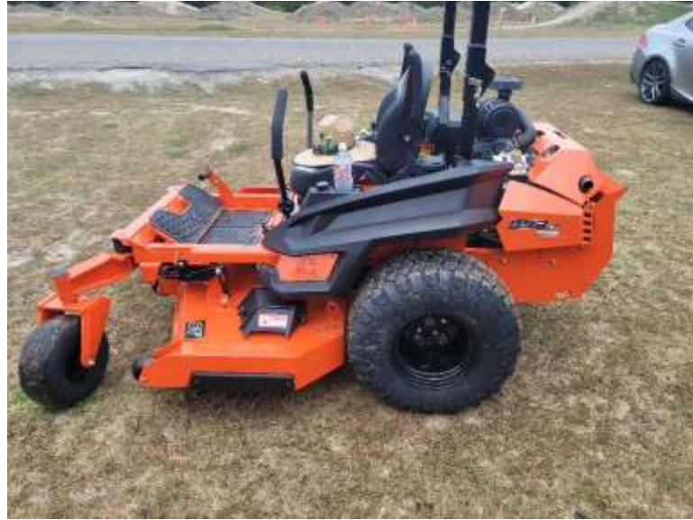
Figure 1. Photo of a 2021 Bad Boy Renegade. Additional photos located in the Appendix.