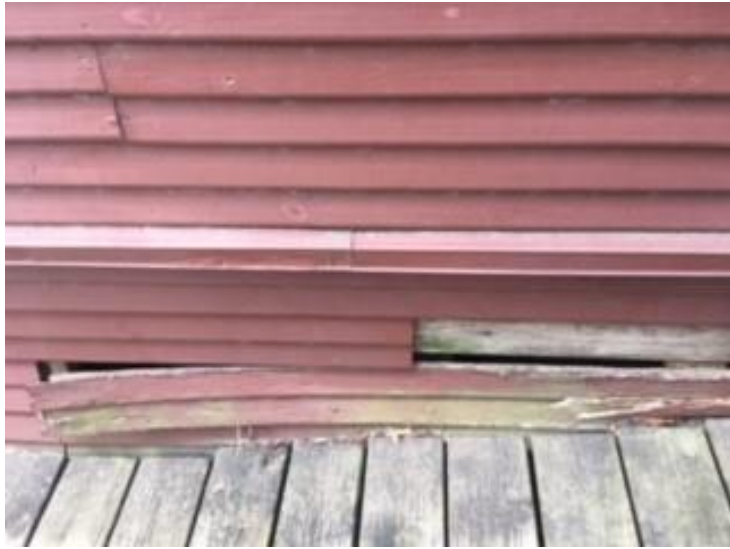
Dixie's Store Wood rot