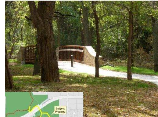
Wilson Creek Pedestrian Bridge and Channel Improvements Completed September 2012