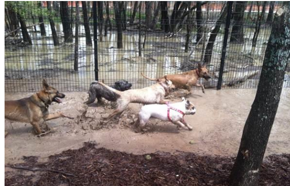
Bonnie Wenk Dog Park Completed June 2013