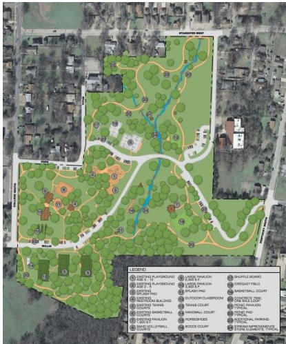
Finch Park Jogging Trails Estimated to Begin Construction October 2013