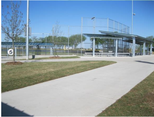
2-Field Baseball Completed April 2013 Gabe Nesbitt Sanitary Sewer Completed May 2013