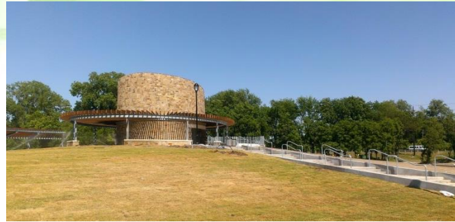
Bonnie Wenk Park Phase I Completed July 2013