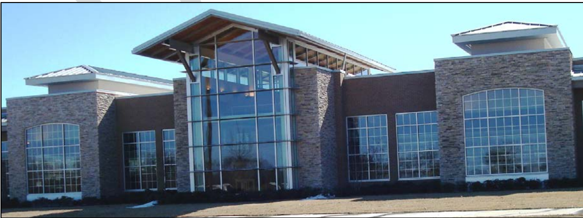
IMAGES 1, 2 & 3. Examples of Appropriate Building Massing.