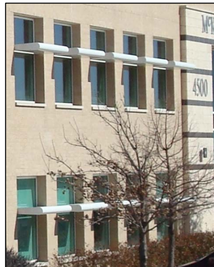
IMAGES 4, 5, 6 & 7. Examples of Appropriate Fenestration.