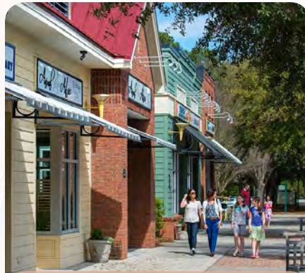
Historic Town Center Mix