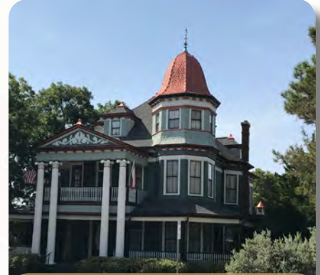
Historic Town Center Residential