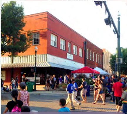
Historic Town Center Downtown