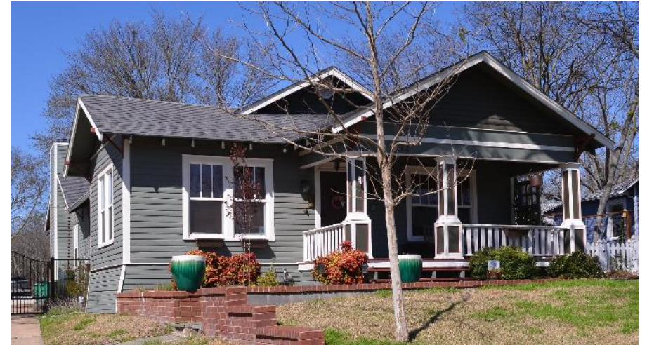
Arts & Crafts/Craftsman Style