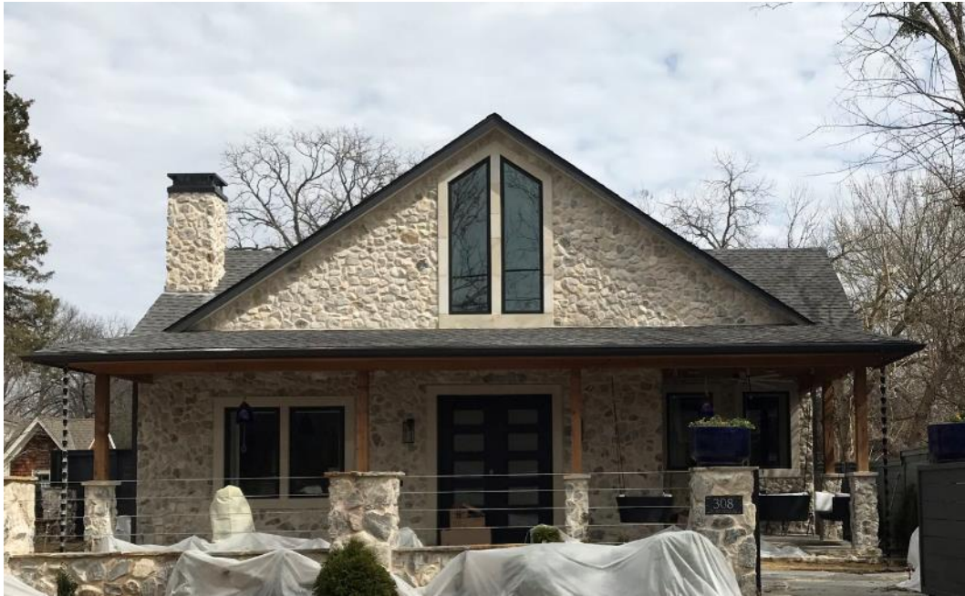
As built elevation