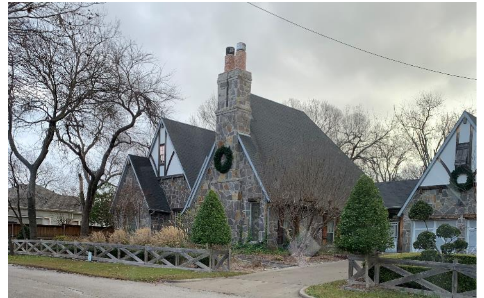
Tudor Revival Style