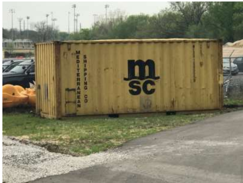
Figure 3. Exterior of shipping container. Which will be cleaned, painted.