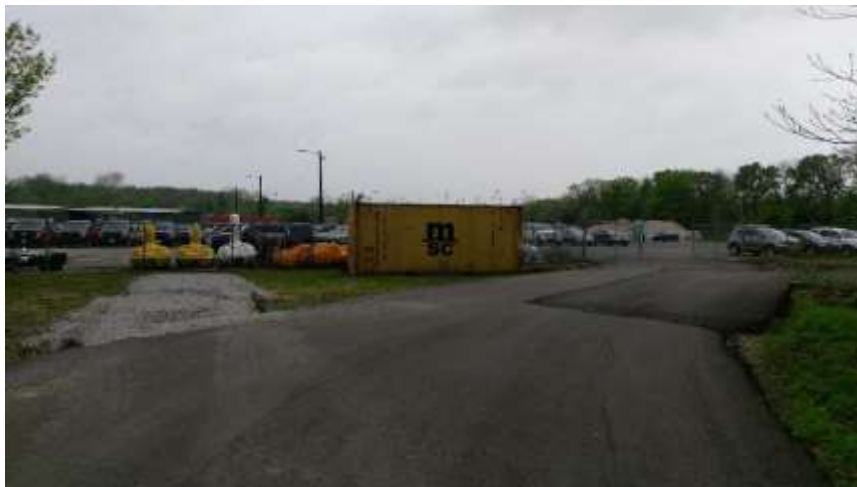
Figure 5. Shipping container and gravel pad for final location.