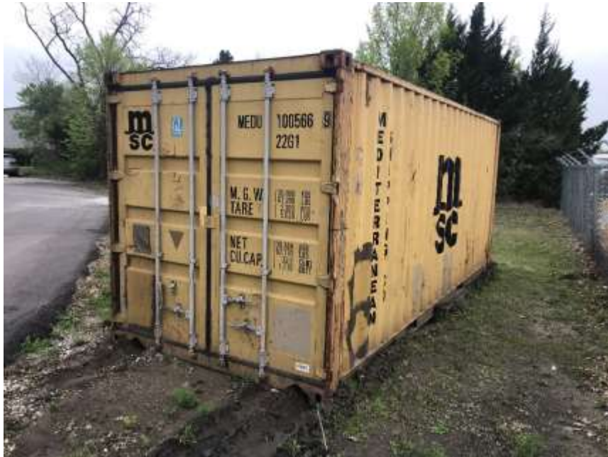
Figure 4. Shipping container.