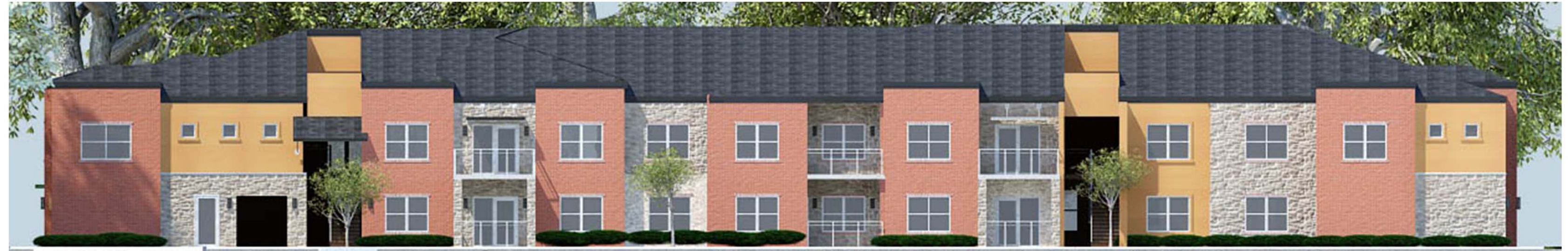
South Elevation - 80% Masonry (46% Brick, 34% Stone, 20% Stucco)