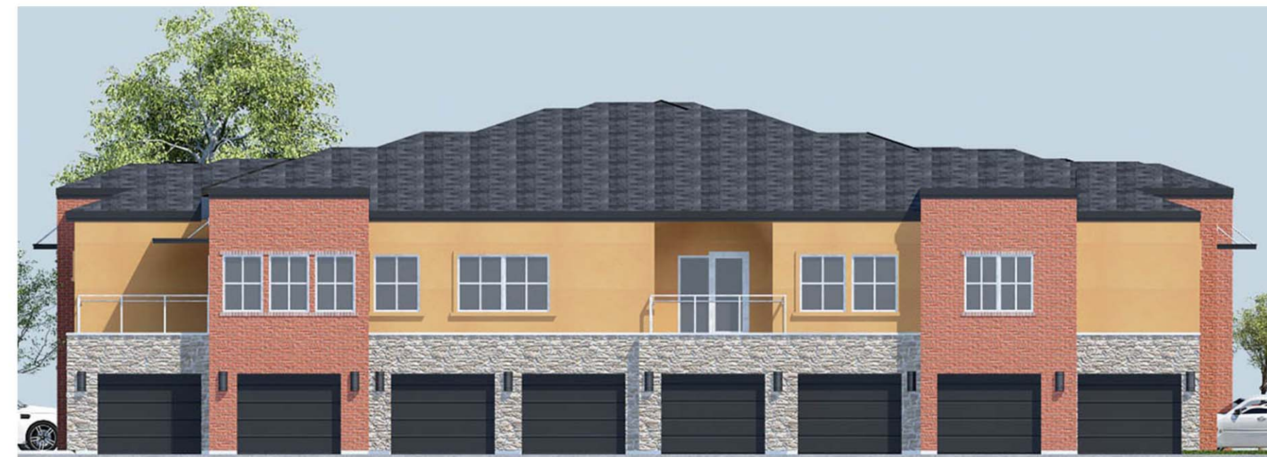
East Elevation - 61% Masonry (36% Brick, 25% Stone, 39% Stucco)