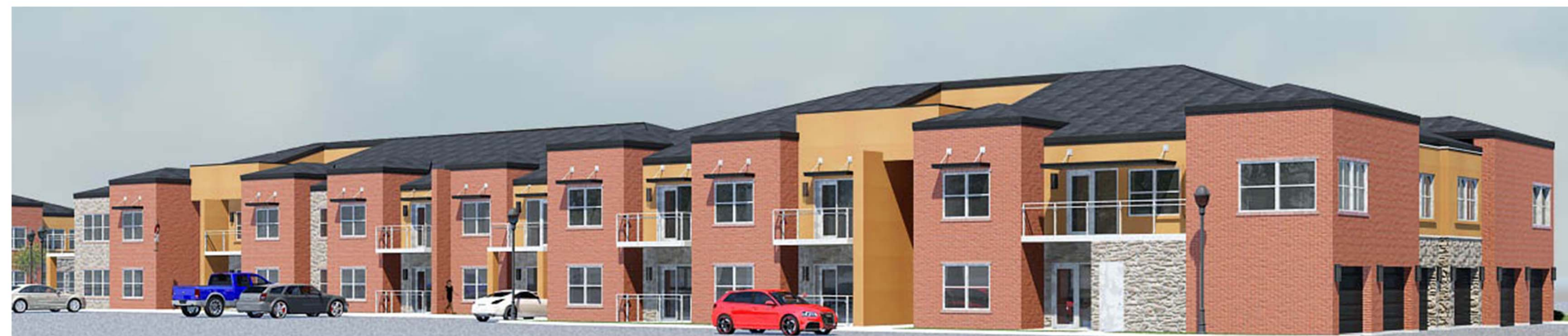
North Elevation - 86% Masonry (74% Brick, 12% Stone, 14% Stucco)