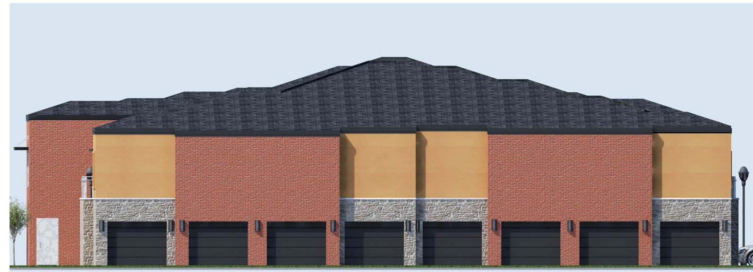
East Elevation - 70% Masonry (53% Brick, 17% Stone, 30% Stucco)