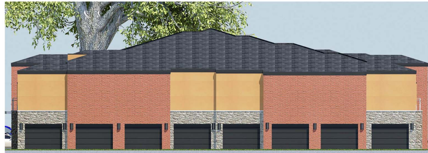
East Elevation - 70% Masonry (53% Brick, 17% Stone, 30% Stucco)