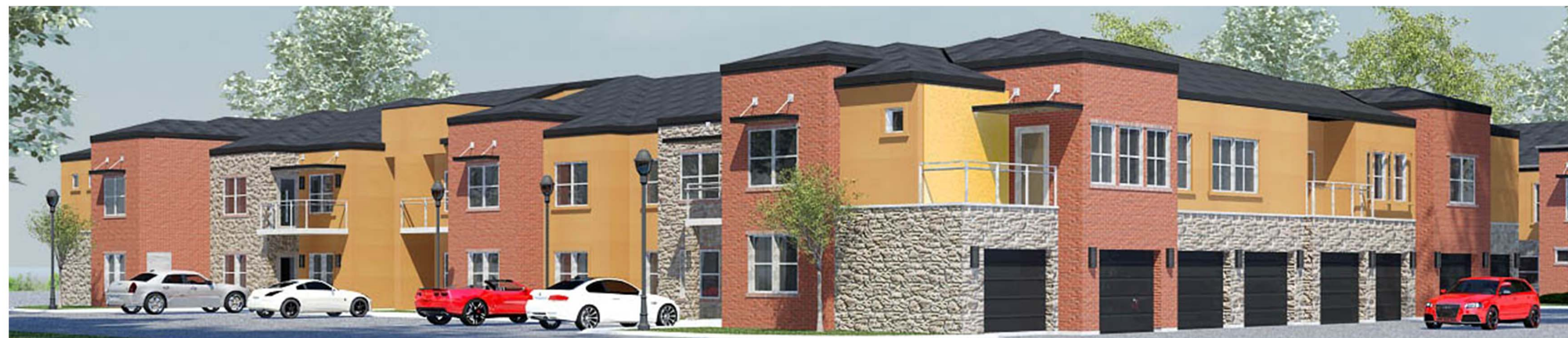
West Elevation - 61% Masonry (36% Brick, 25% Stone, 39% Stucco)