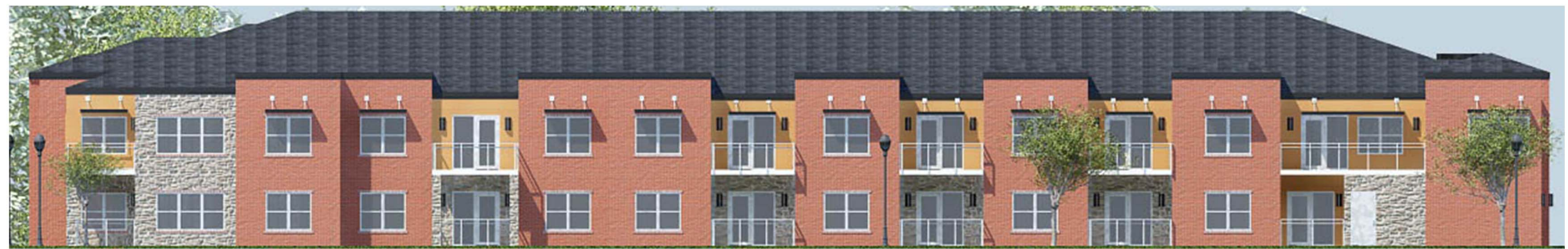
West Elevation - 86% Masonry (68% Brick, 18% Stone, 14% Stucco)