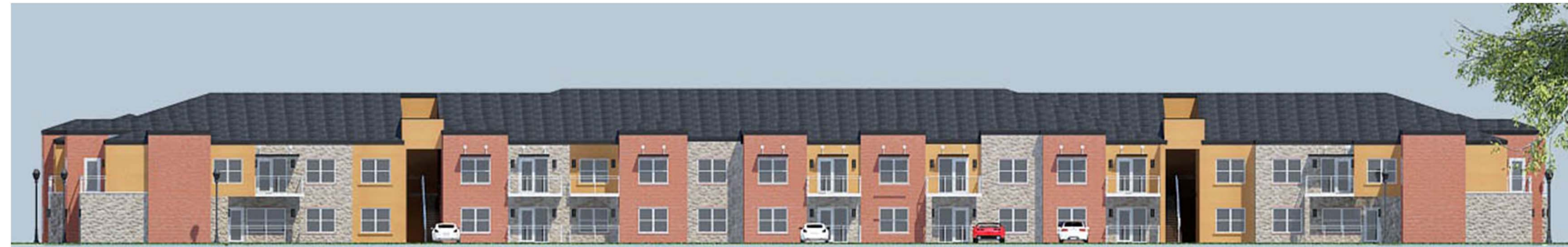
East Elevation - 80% Masonry (40% Brick, 40% Stone, 20% Stucco)