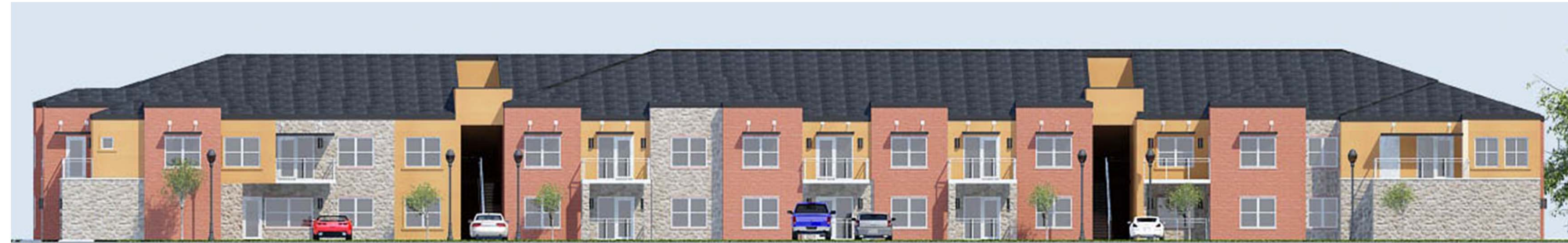
South Elevation - 74% Masonry (40% Brick, 34% Stone, 26% Stucco)