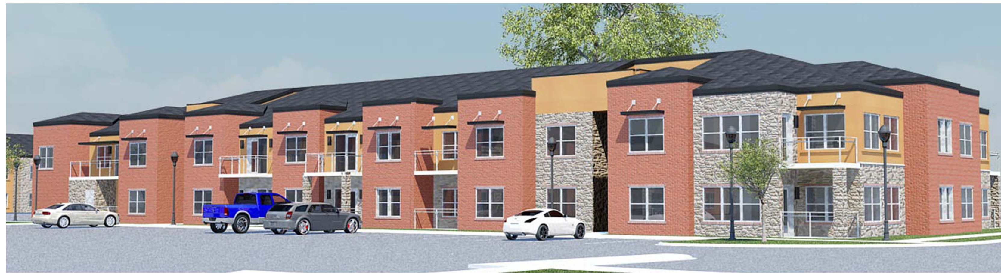
North Elevation - 82% Masonry (51% Brick, 31% Stone, 18% Stucco)