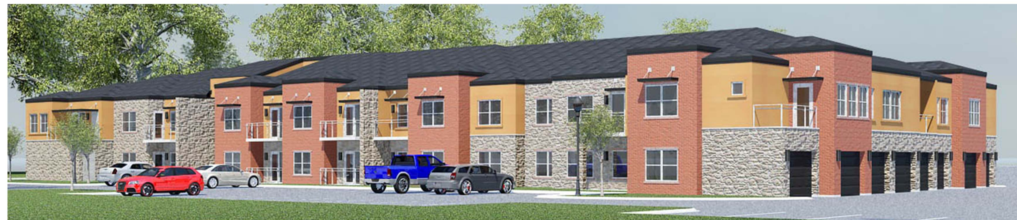
West Elevation - 63% Masonry (36% Brick, 27% Stone, 37% Stucco)