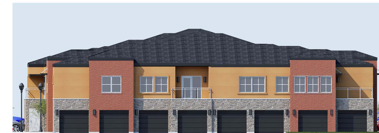
West Elevation - 63% Masonry (36% Brick, 21% Stone, 37% Stucco)