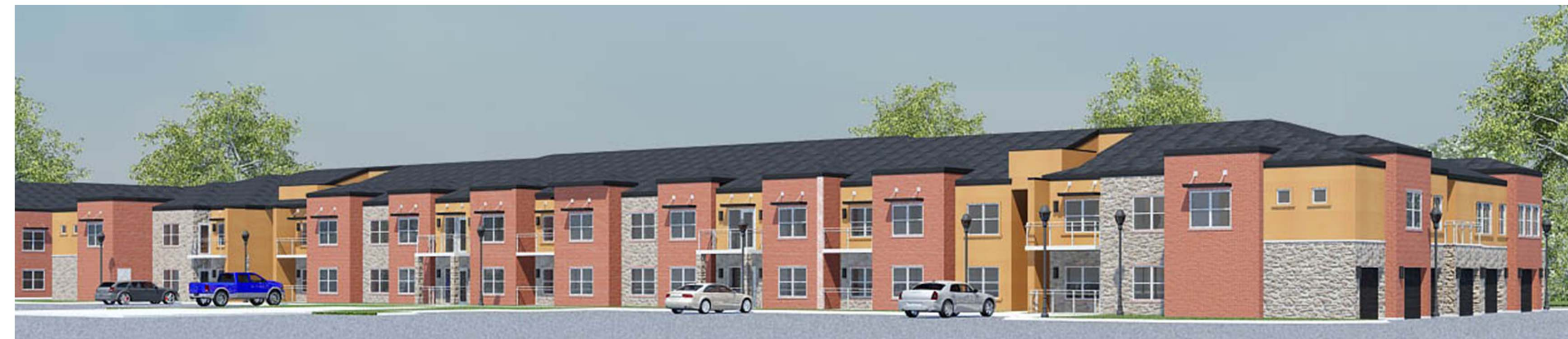
North Elevation - 63% Masonry (36% Brick, 27% Stone, 37% Stucco)