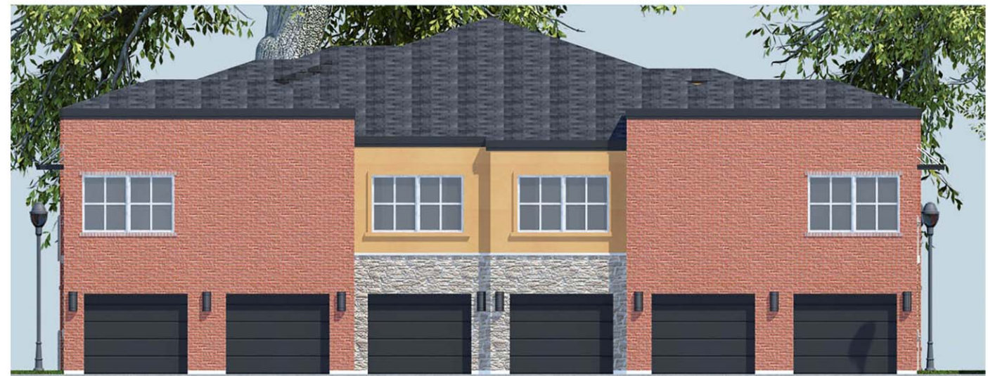
South Elevation - 87% Masonry (76% Brick, 11% Stone, 13% Stucco)