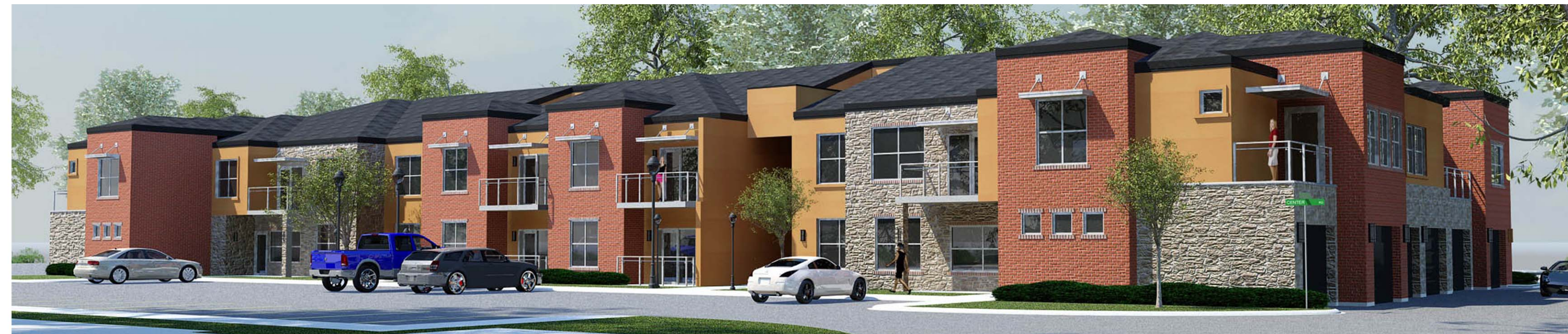
West Elevation - 71% Masonry (51% Brick, 20% Stone, 29% Stucco)