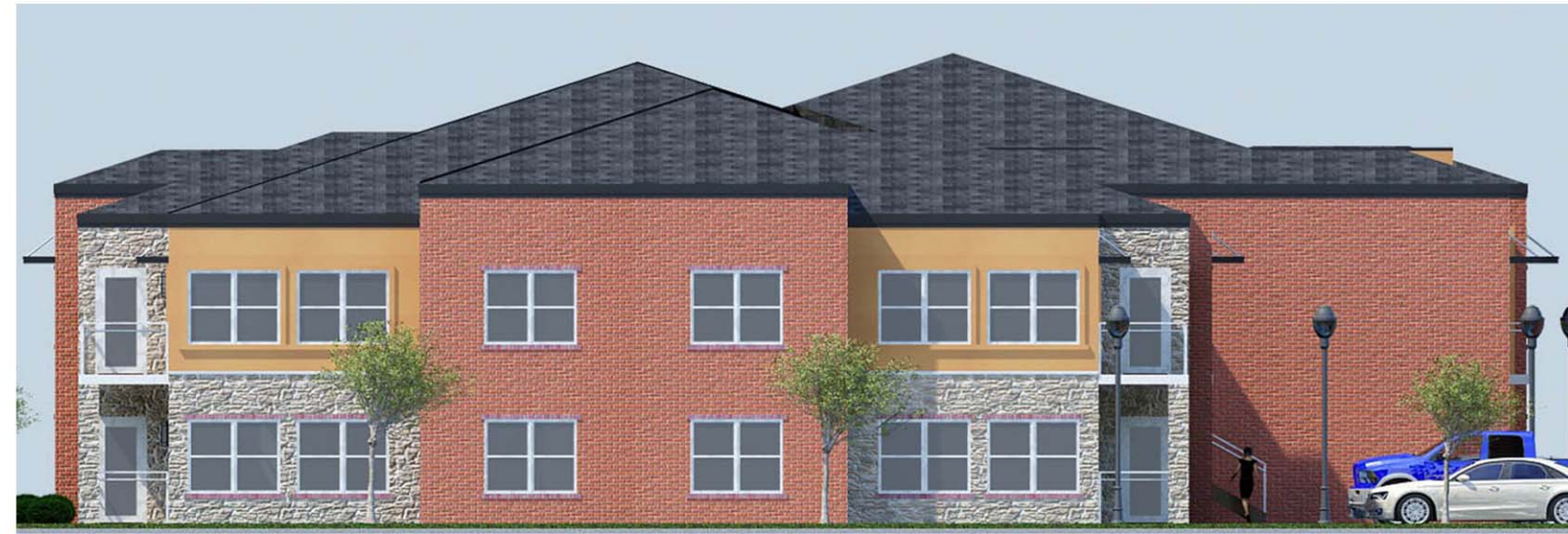
South Elevation - 82% Masonry (51% Brick, 31% Stone, 18% Stucco)