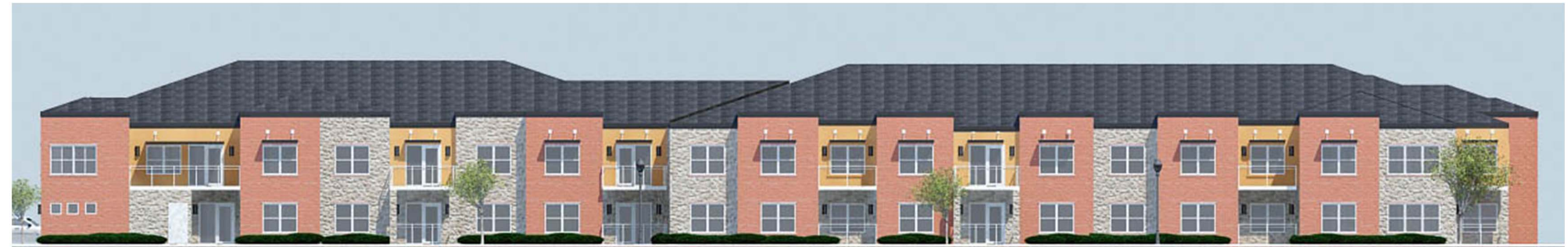
West Elevation - 86% Masonry (53% Brick, 33% Stone, 14% Stucco)