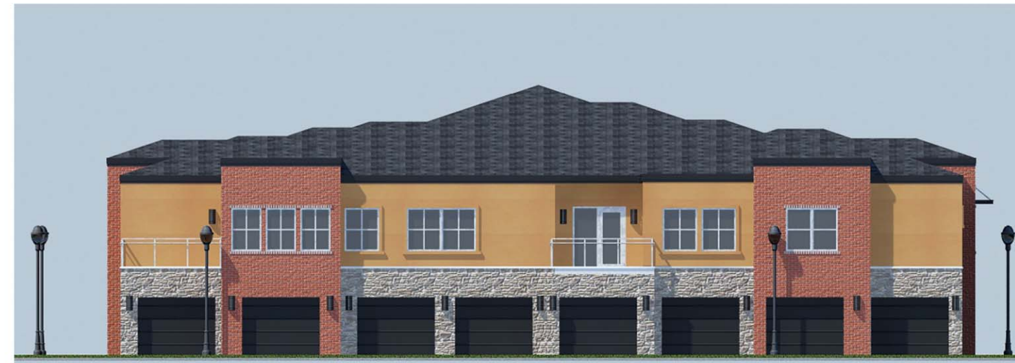
South Elevation - 63% Masonry (36% Brick, 27% Stone, 37% Stucco)