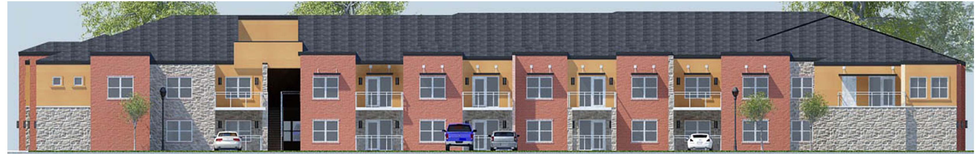
South Elevation - 79% Masonry (45% Brick, 34% Stone, 21% Stucco)