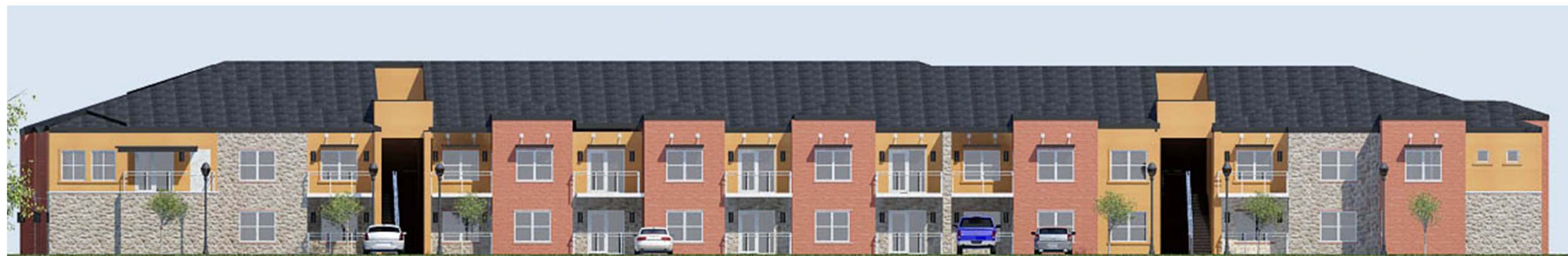
North Elevation - 69% Masonry (33% Brick, 36% Stone, 31% Stucco)