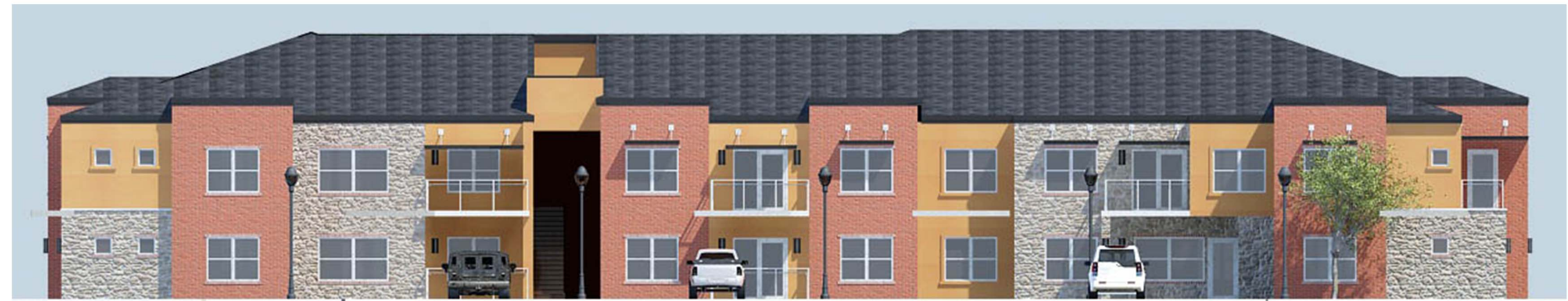
South Elevation - 69% Masonry (39% Brick, 30% Stone, 31% Stucco)