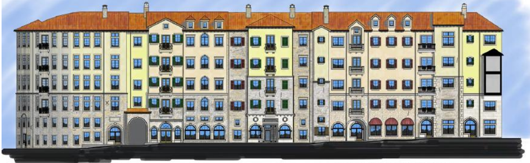
01 Building 3- North Elevation SCALE: 3/32" = 1'-0"

MATERIALS: RUBBLE STONE FLAT PANEL STONE WINDOW AND DOOR SURROUNDS: MASONRY STUCCO GRANDBURY LEIDERS LEIDERS