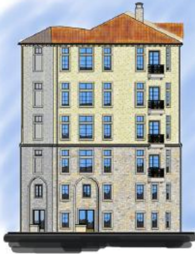
08 Building 3- East Elevation SCALE: 3/32" = 1'-0"