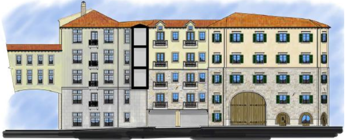
02 Building 3- West Elevation SCALE: 3/32" = 1'-0"

MATERIALS: RUBBLE STONE FLAT PANEL STONE WINDOW AND DOOR SURROUNDS: MASONRY STUCCO GRANDBURY LEIDERS LEIDERS