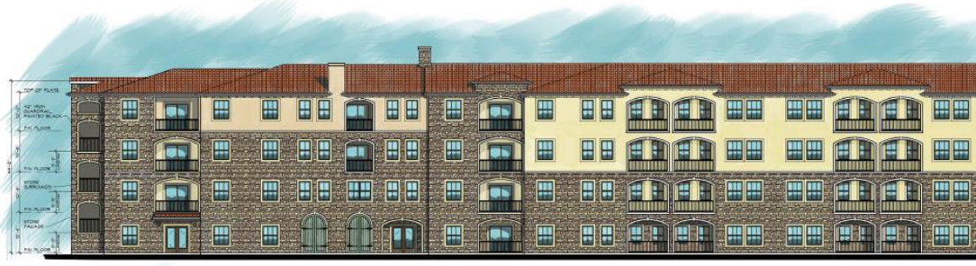
05 South Elevation- Courtyard SCALE 1/8" = 1'-0"