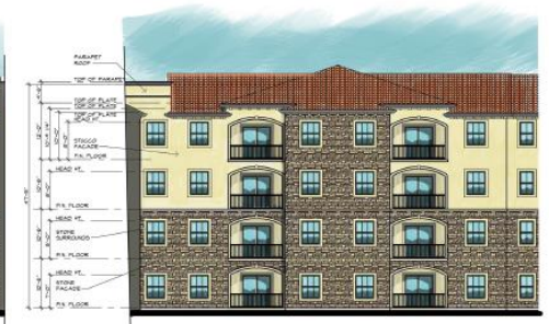
04 West Elevation- Courtyard SCALE 1/8" = 1'-0"