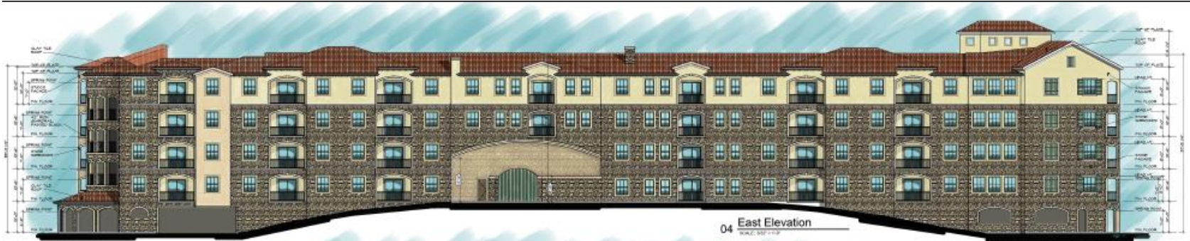
04 East Elevation SCALE: 1/8" = 1'-0"