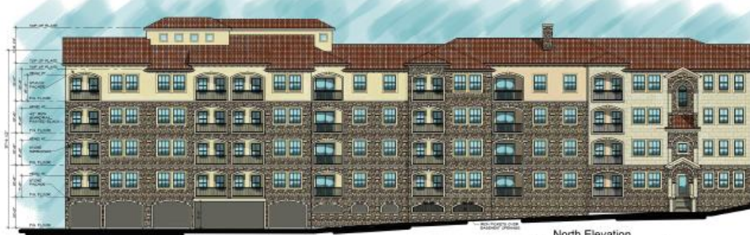
03 North Elevation SCALE: 1/8" = 1'-0"