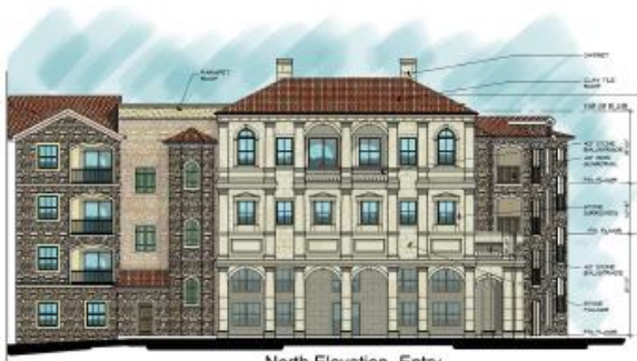
02 North Elevation- Entry SCALE: 1/4" = 1'-0"