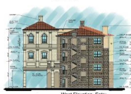
01 West Elevation- Entry SCALE: 1/4" = 1'-0"

ADRIATICA 6025 Wood Hammeron Drive McKinney, Texas 75070 972.988.8283 214.272.2140 www.adriaticainc.com 844.469.8283 844.469.8283 844.469.8283 Architecture