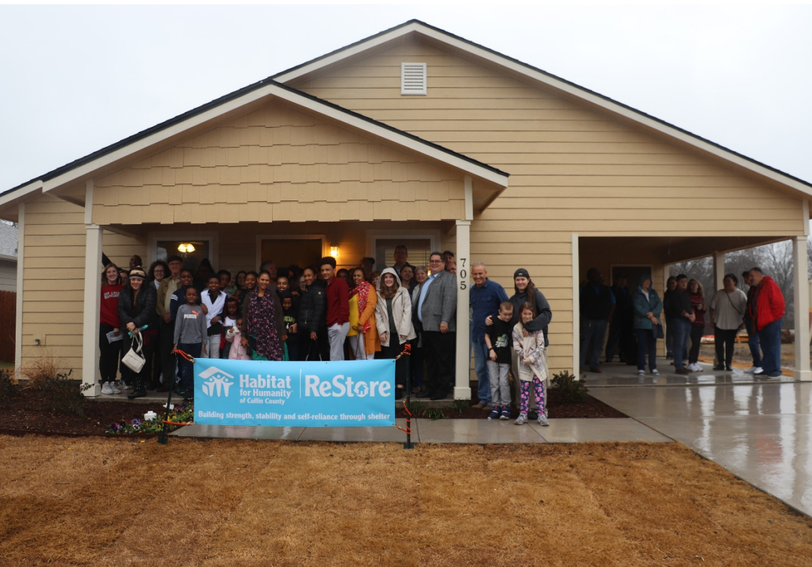
Affordable Housing Partners in McKinney, Texas