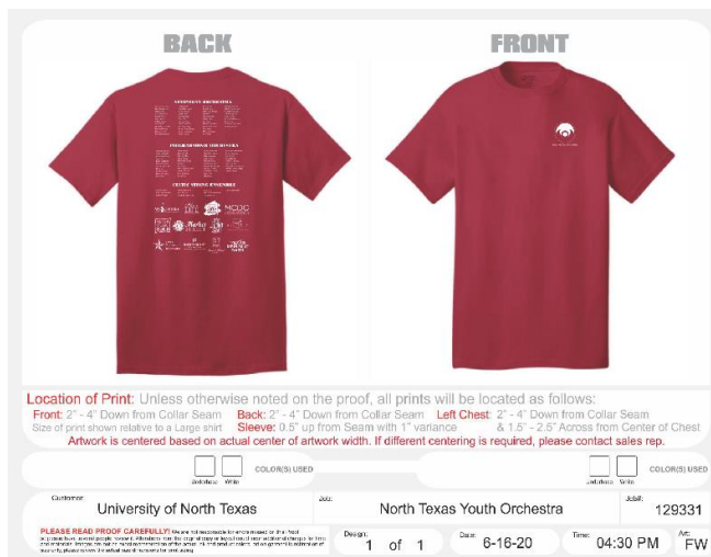
Image of the 2019-2022 GNTYO T shirt

We have included logo of Visit McKinney every since.