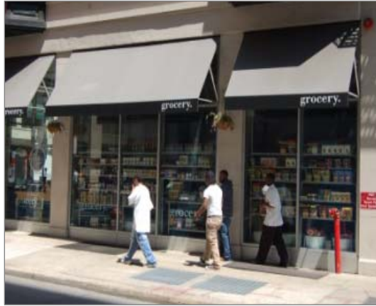
Images illustrating acceptable storefront display windows with transparency