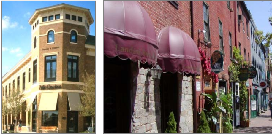
Images illustrating acceptable architectural features and storefront elements that add pedestrian interest along the street.

Corner-emphasizing architectural features, pedimented gabled parapets, cornices, awnings, blade signs, arcades, colonnades and balconies should be used on the Virginia Street façade and the Chestnut Street façade to add pedestrian interest.