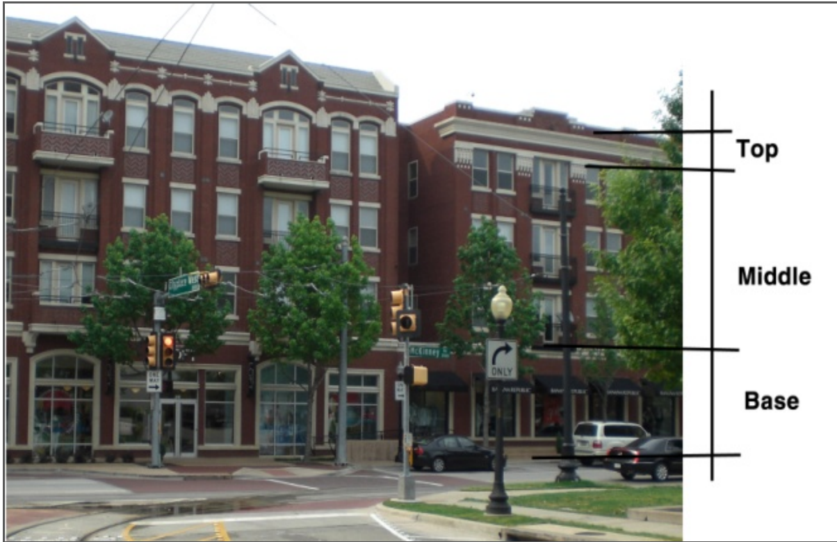
Image illustrating simple and rectilinear building form with a clear base, middle, and top