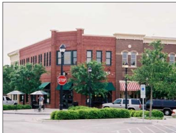
Images illustrating acceptable exterior building materials

The rear façade (facing Herndon Street) and the side facade (facing the adjacent property to the east) shall be of a similar finished quality and color that blend with the Virginia Street and Chestnut Street facades. In addition to the primary and accent façade materials listed above, the rear facade may be painted EIFS or painted concrete block matching the same color of the rest of the building.