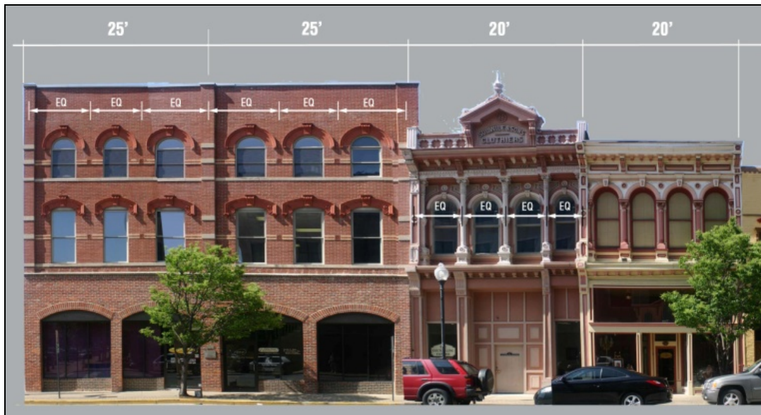
Image illustrating acceptable building rhythm

Building façade along Virginia Street and Chestnut Street shall maintain the traditional façade rhythm of 20' – 30'. This rhythm may be expressed by changing materials, or color, or by using design elements such as fenestration, columns and pilasters, or by varying the setback of portions of the building façade.