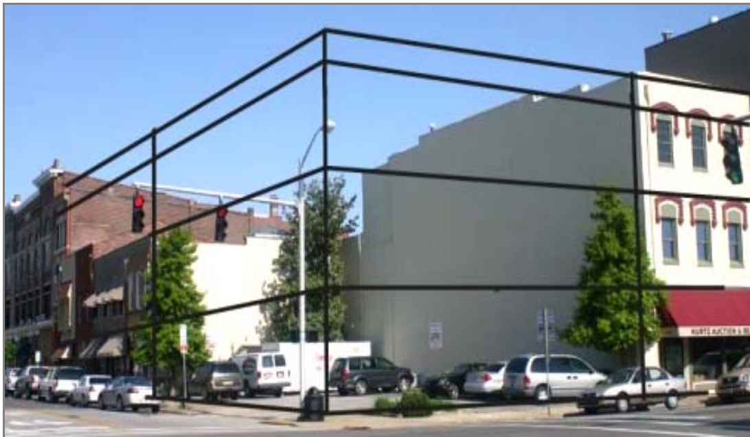
Image illustrating how horizontal elements in new infill building shall generally maintain the alignment of horizontal elements already prevalent along adjacent blocks.

Infill buildings shall generally maintain the alignment of horizontal elements already prevalent along adjacent blocks.