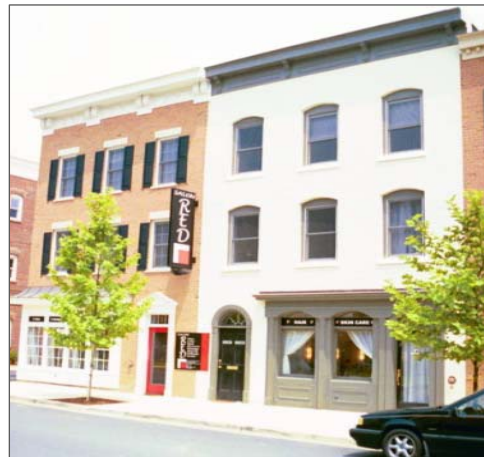
Images illustrating acceptable window and door designs and proportions