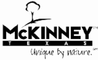
Exhibit 2: Example City of McKinney Confidentiality Statement