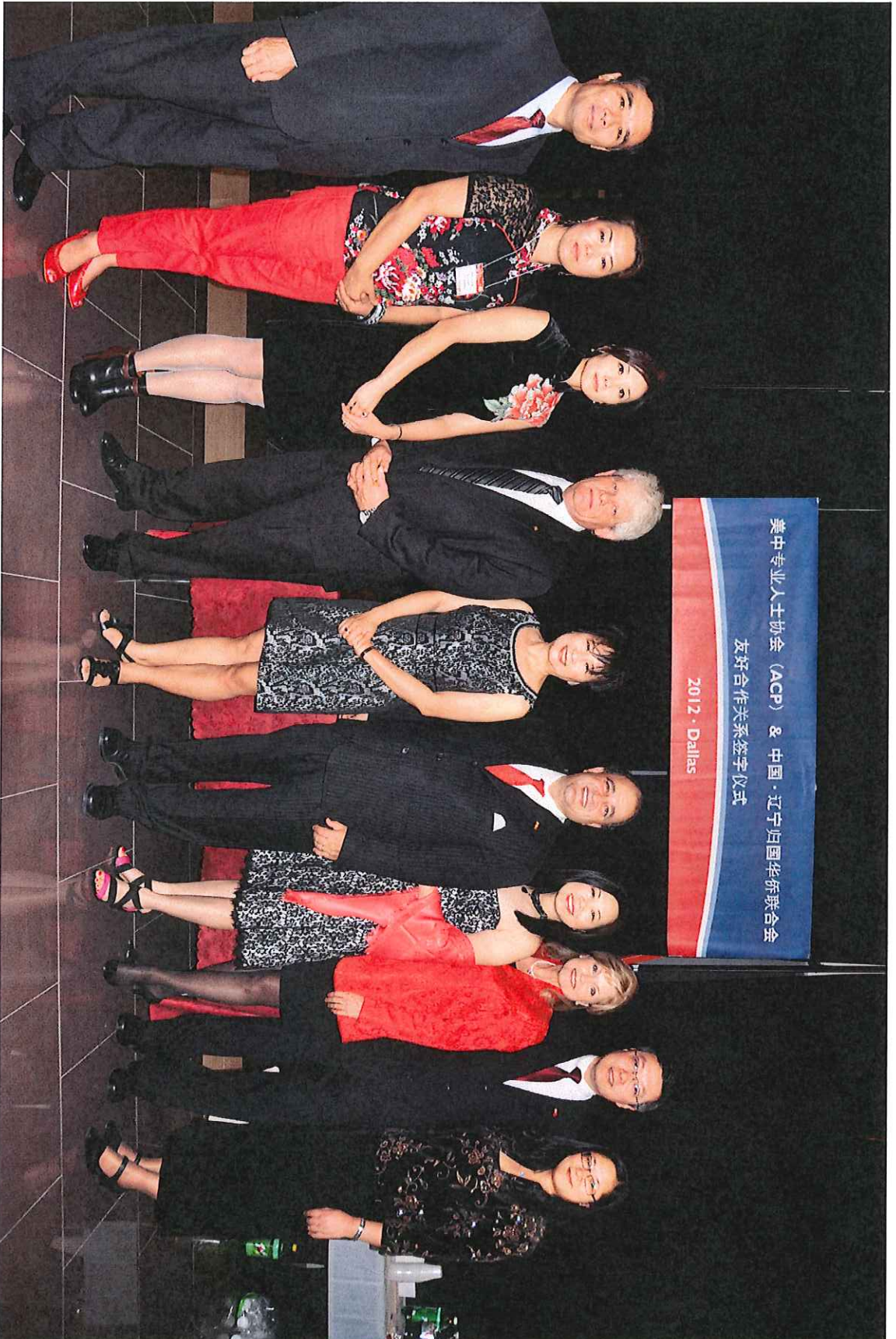
Li Guixi Deputy Consul General The People's Republic of China in Houston