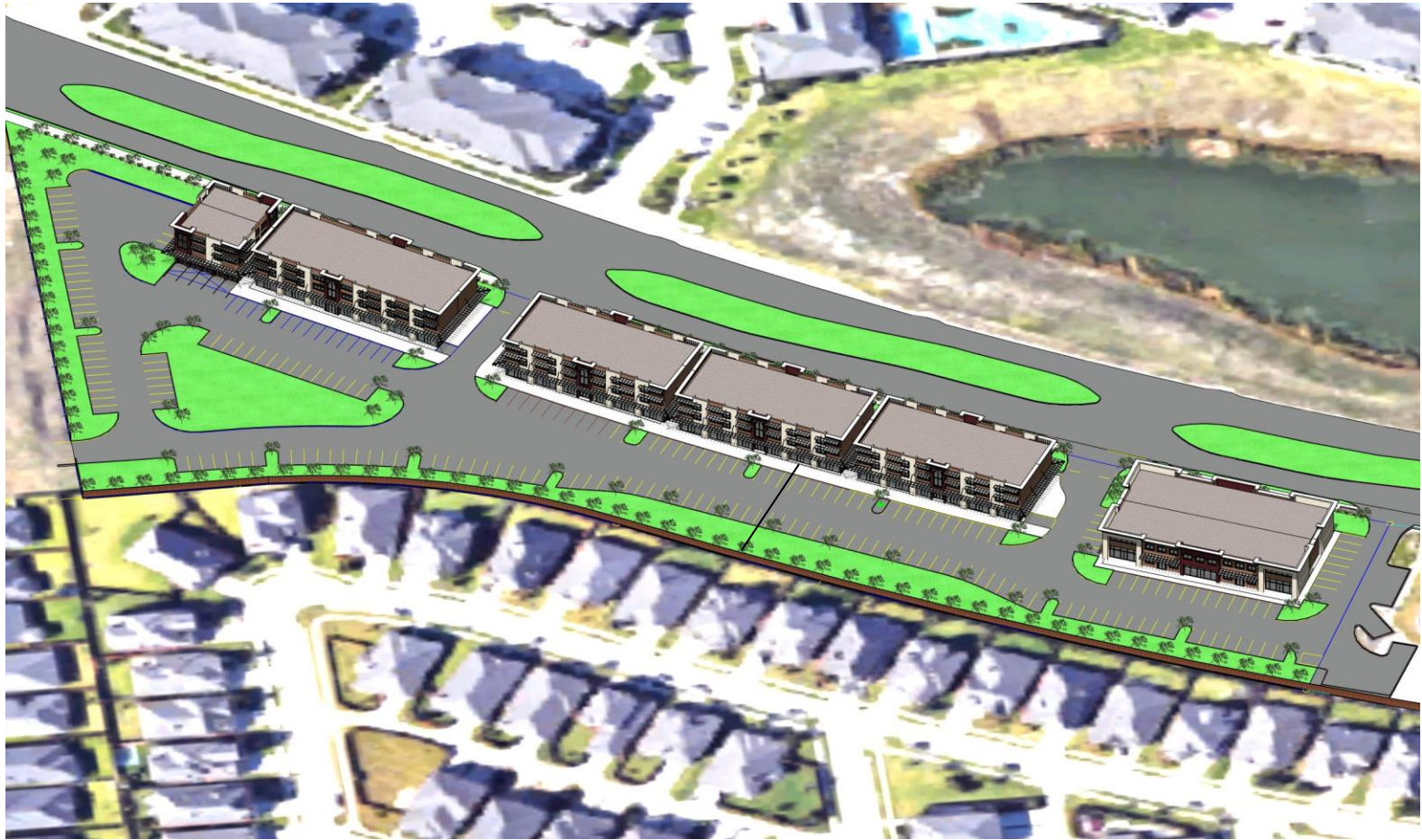
BUILDINGS - PER PROPOSED ZONING