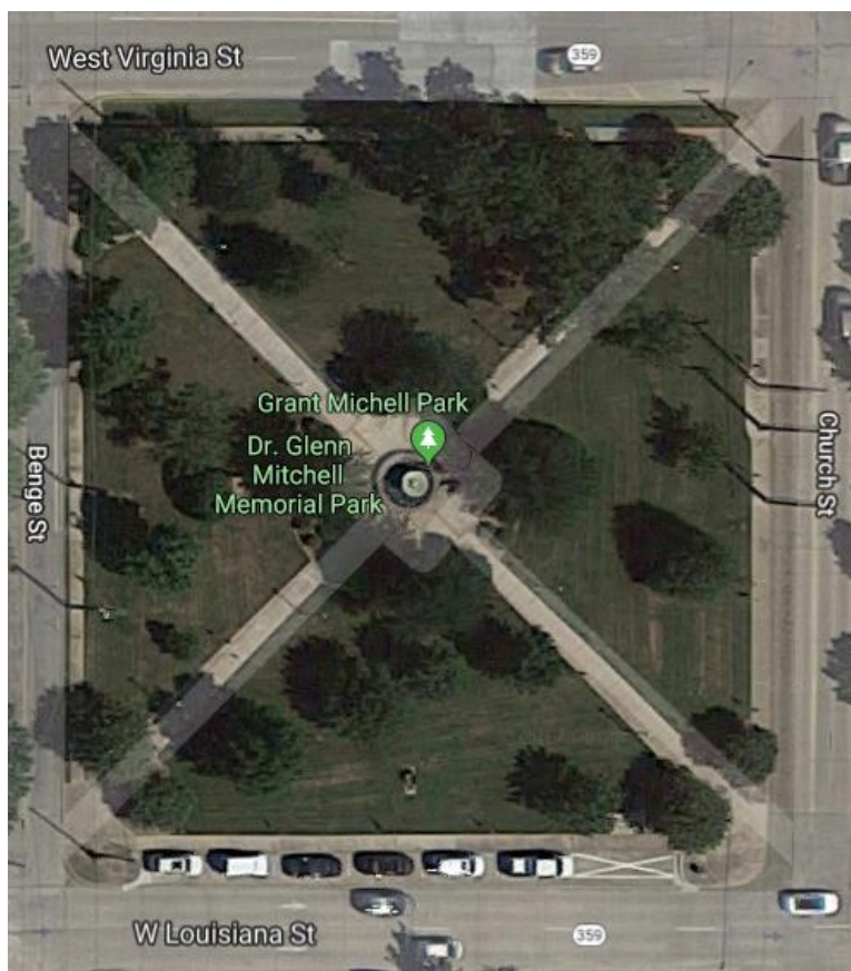
Aerial view of the Dr. Glenn Mitchell Memorial Park and streets.

The land comprising Dr. Glenn Mitchell Park originally housed a church with native pecan trees along the West Virginia side. Several of these mature pecan trees remain, forming a semicircle, roughly the shape of a comma, along the West Virginia/ Church Street corner.