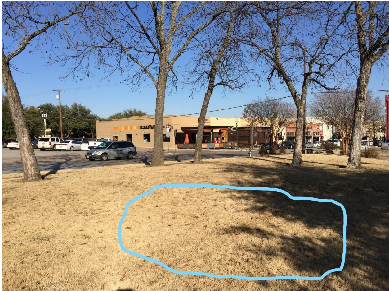
Street level view of art installation location (highlighted) among historic pecan trees. Distance of the site from the far left and right trees is 25 feet in each direction.

Symbolic of the history, beauty and contemplative nature of the Park, this particular location presents the artist with the opportunity to integrate these mature pecan trees into the overall scope of the project.