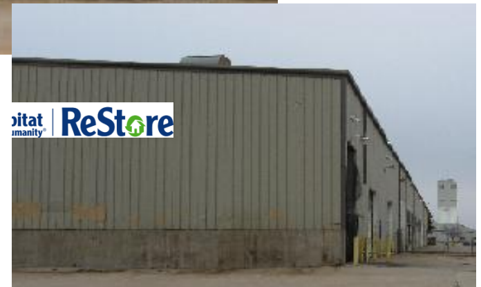
Back of building and side view