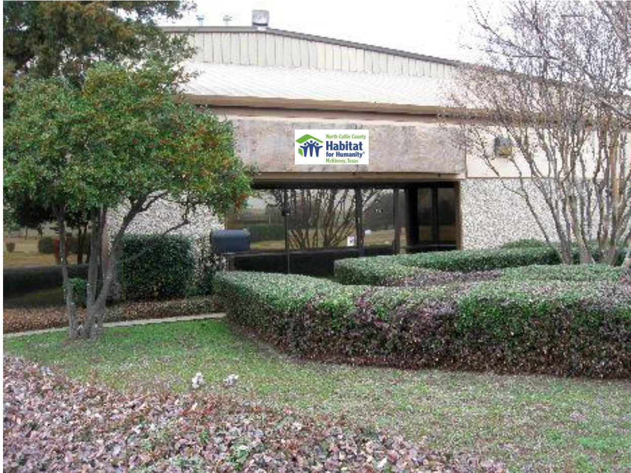
Front entrance – Administrative Offices (formerly Watson&Chalin Mfg. , Inc.)