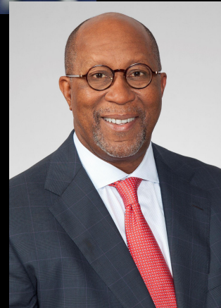
Ambassador Ron Kirk

-Former Dallas Cowboys Running Back -2010 NFL Hall of Fame Recipient