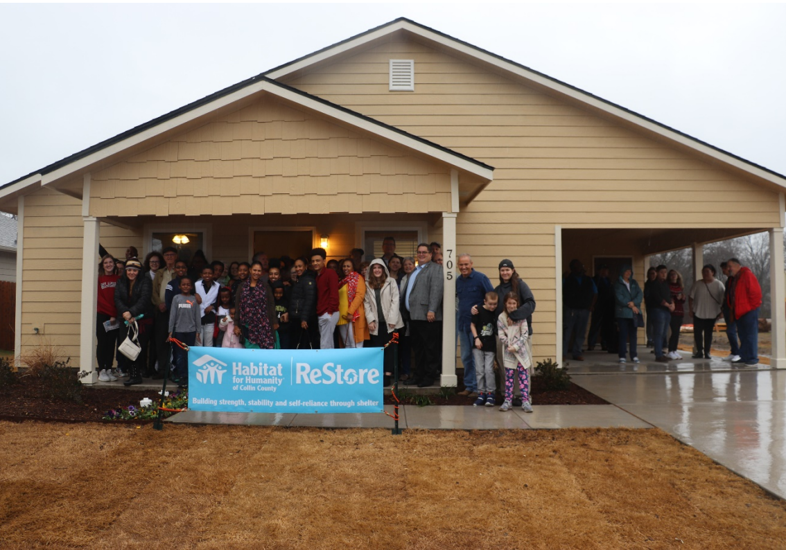
Affordable Housing Partners in McKinney, Texas