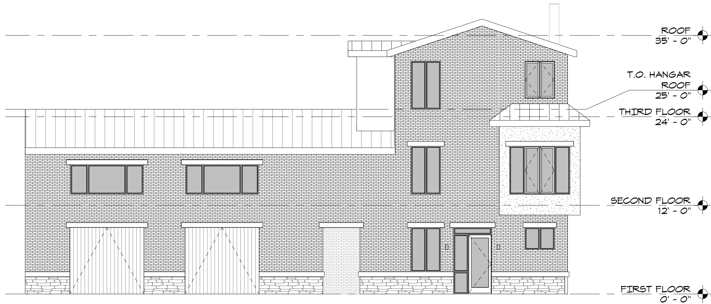
1 FRONT ELEVATION - UNIT A SCALE : 1/8" = 1'-0"