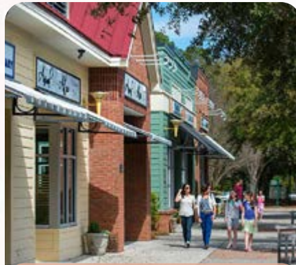
Historic Town Center Mix