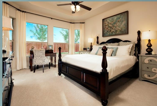
Stone Hollow McKinney, Texas