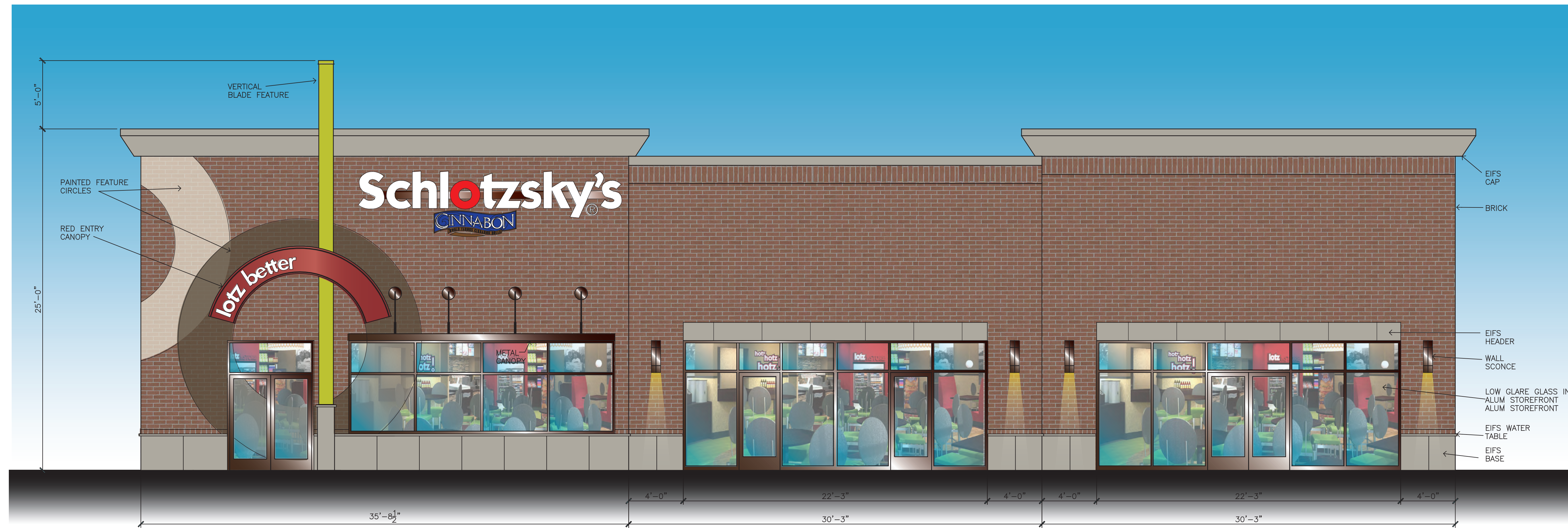
01 NORTH EXTERIOR ELEVATION 1/4" = 1'-0"