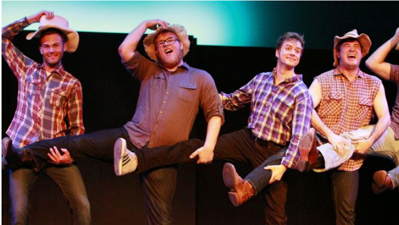
McKinney Summer Musicals