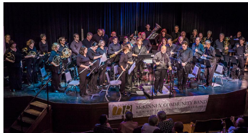
McKinney Community Band