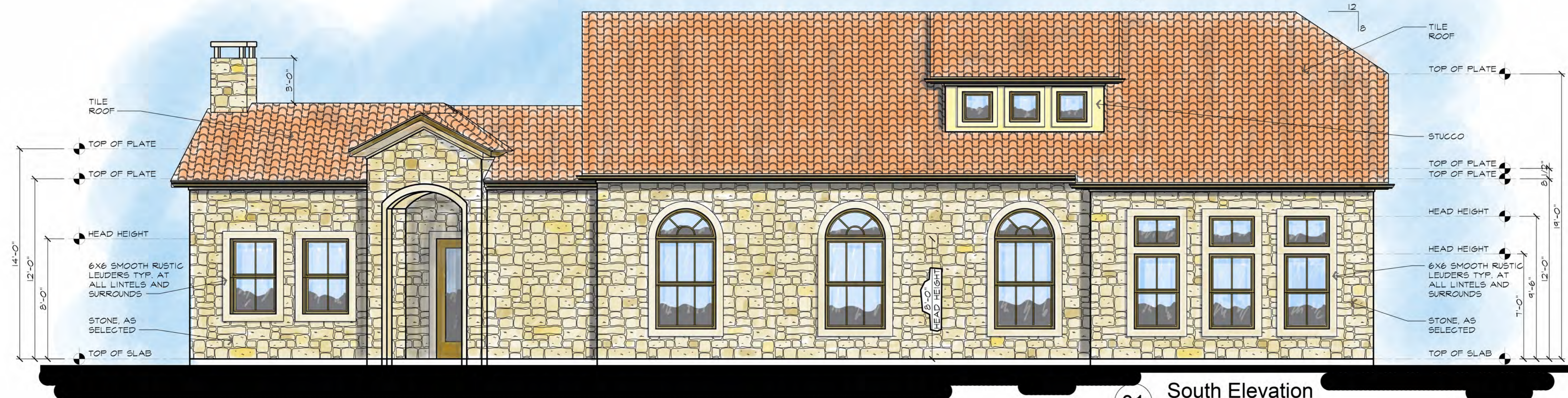
01 South Elevation SCALE: 1/4" = 1'-0"