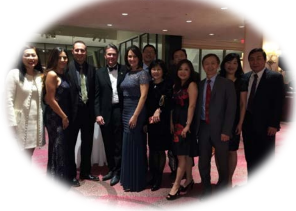
Part of the group representing McKinney