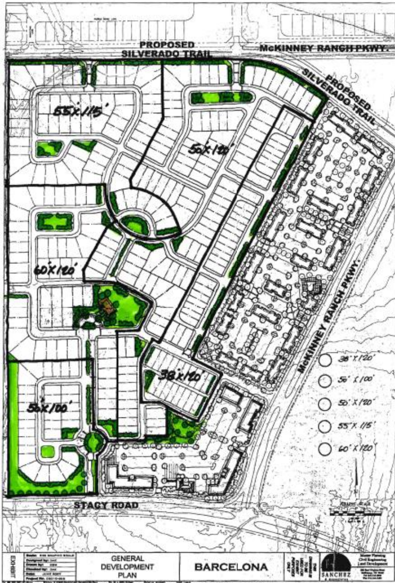
Governing Zoning Exhibit