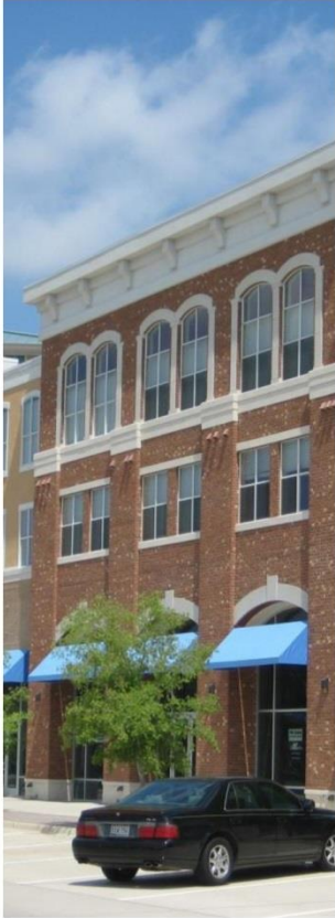
Mixed-Use Ground Floor Office/Retail

Prototypical Images of Development Quality Desired for Collide Center District