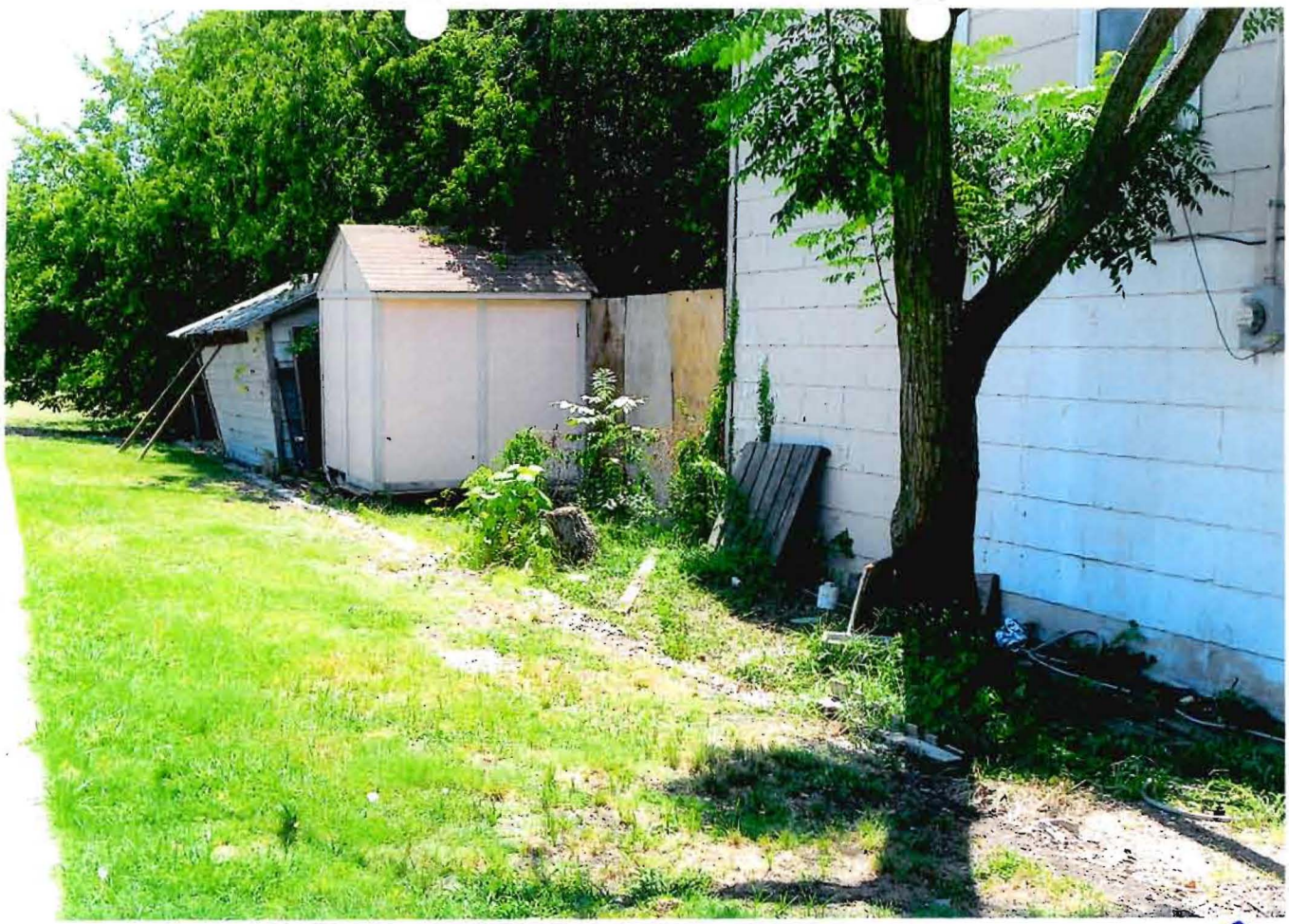
Photo of the property on the south of our property. (1309 + 1309 1/2 S. Tennessee) ↑ Property Line