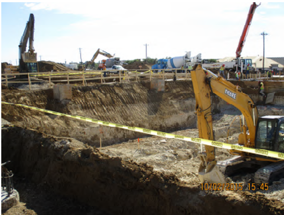
Competition pool excavation.