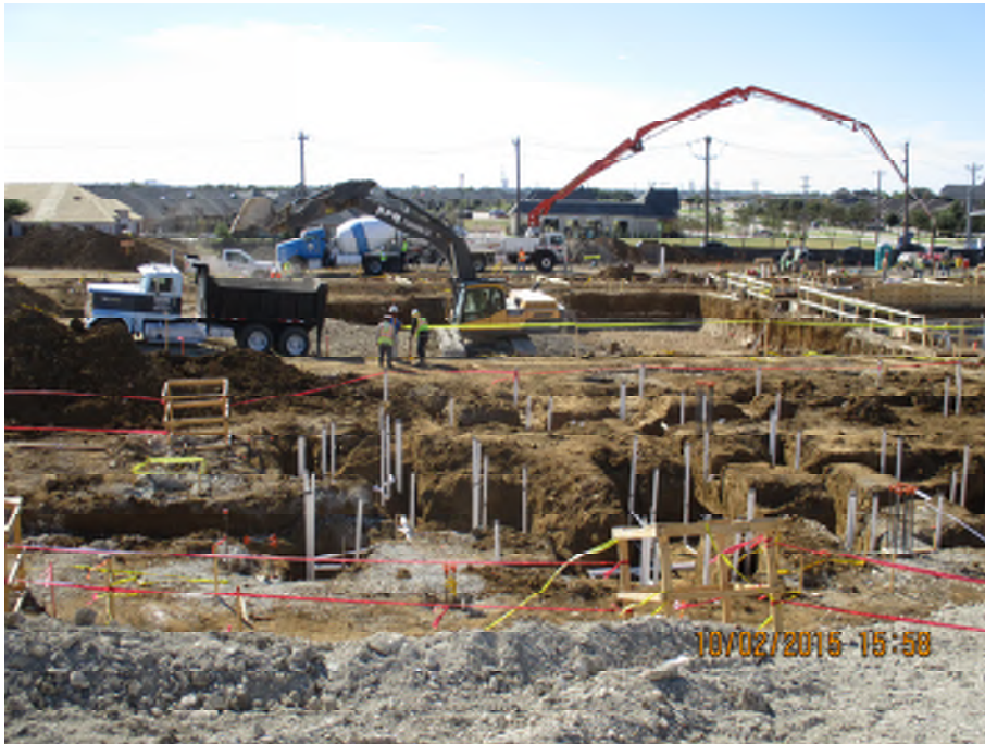
Lower level underground plumbing and grade beams.