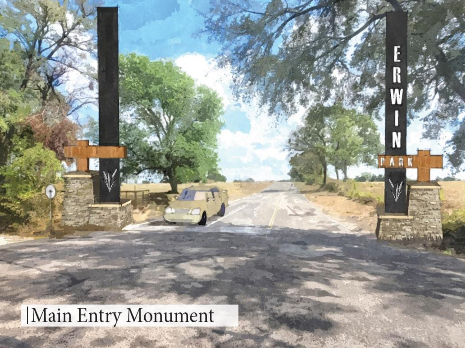
| Main Entry Monument