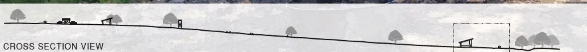
CROSS SECTION VIEW