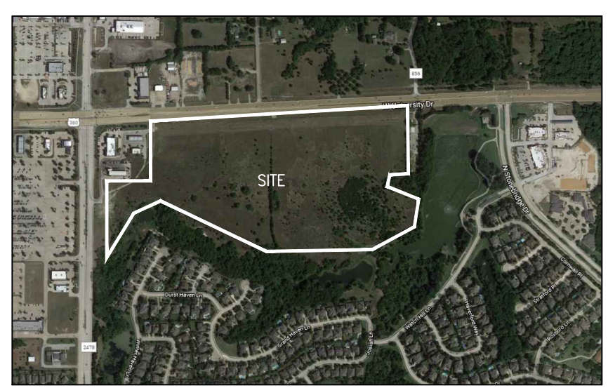
VICINITY MAP N.T.S.