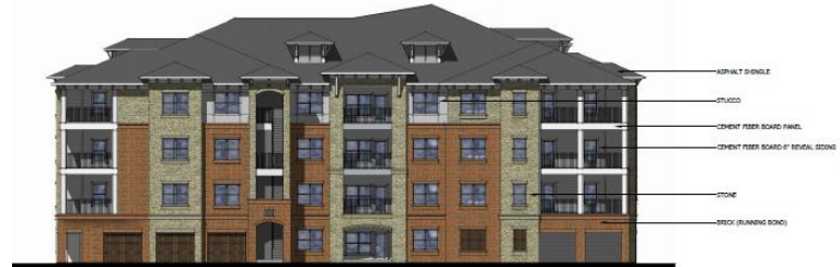
2 BUILDING 1- SOUTH ELEVATION SCALE: 3/32" = 1'-0"

MATERIAL PERCENTAGES (SEE LEGEND) BRICK: 50% STONE: 20% STUCCO: 10% CEMENT FIBER BOARD: 20%