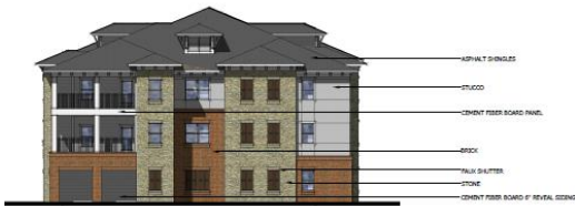
2 BUILDING 6- EAST ELEVATION SCALE: 3/32" = 1'-0"