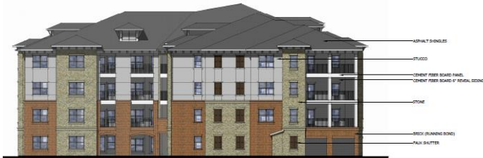
2 BUILDING 7- NORTH ELEVATION SCALE: 3/32" = 1'-0"