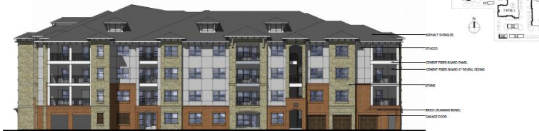
2 BUILDING 5- EAST ELEVATION SCALE: 3/8" = 1'-0"