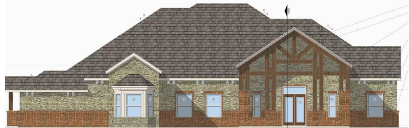
2 CLUBHOUSE - REAR

COLORS MAY CHANGE SUBJECT TO SECTION 166-100(X)(3) AND USE OF A SIMILAR, NATURAL TONE.