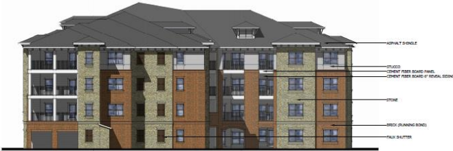
2 BUILDING 1- NORTH ELEVATION SCALE: 3/32" = 1'-0"

MATERIAL PERCENTAGES (SEE LEGEND) BRICK: 40% STONE: 40% STUCCO: 10% CEMENT FIBER BOARD: 10%