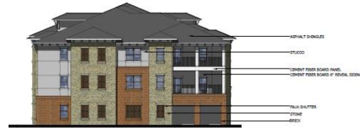
2 BUILDING 6- WEST ELEVATION SCALE: 3/32" = 1'-0"