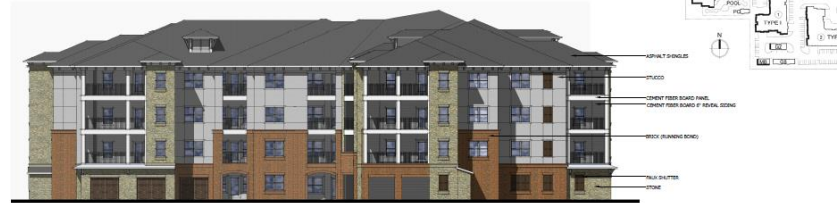
2 BUILDING 5- WEST ELEVATION SCALE: 3/8" = 1'-0"