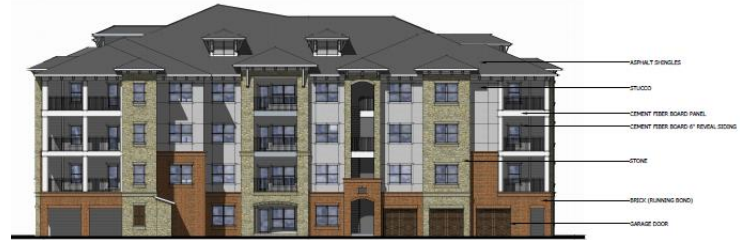
2 BUILDING 7- SOUTH ELEVATION SCALE: 3/32" = 1'-0"