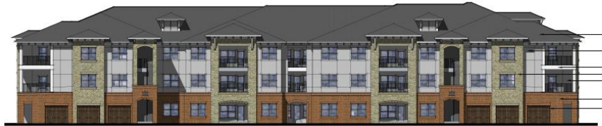
1 BUILDING 6- SOUTH ELEVATION