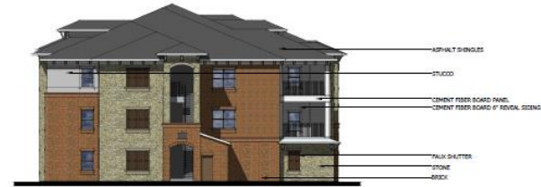
2 BUILDING 3- WEST ELEVATION (85% MASONRY) SCALE: 3/32" = 1'-0"