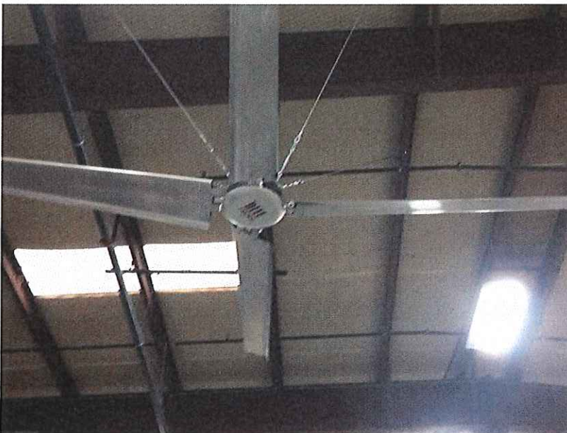
Garage Doors: The doors have been ordered, but haven't been received yet.