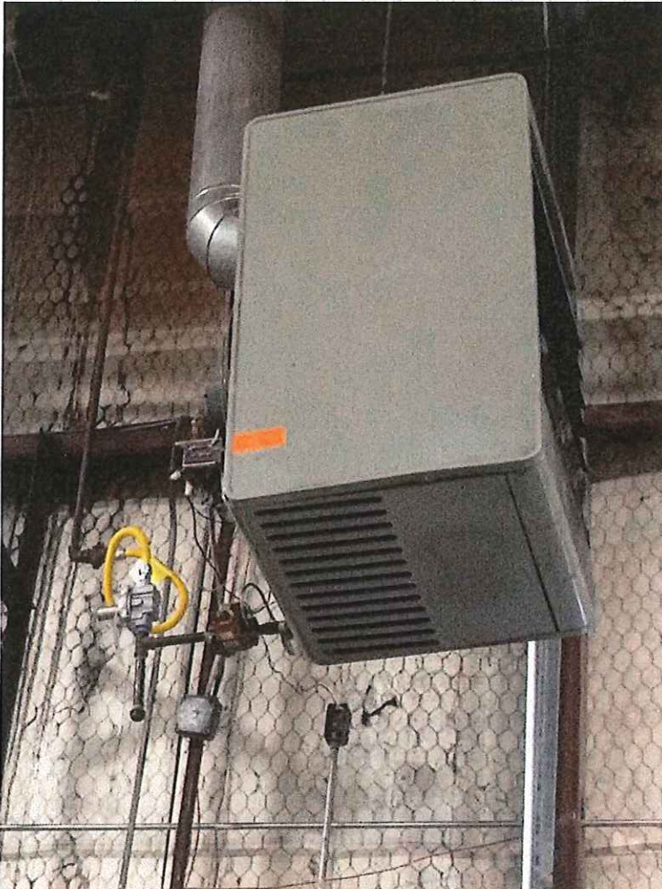
Heaters: The gas line has been upgraded with regulators on each unit.