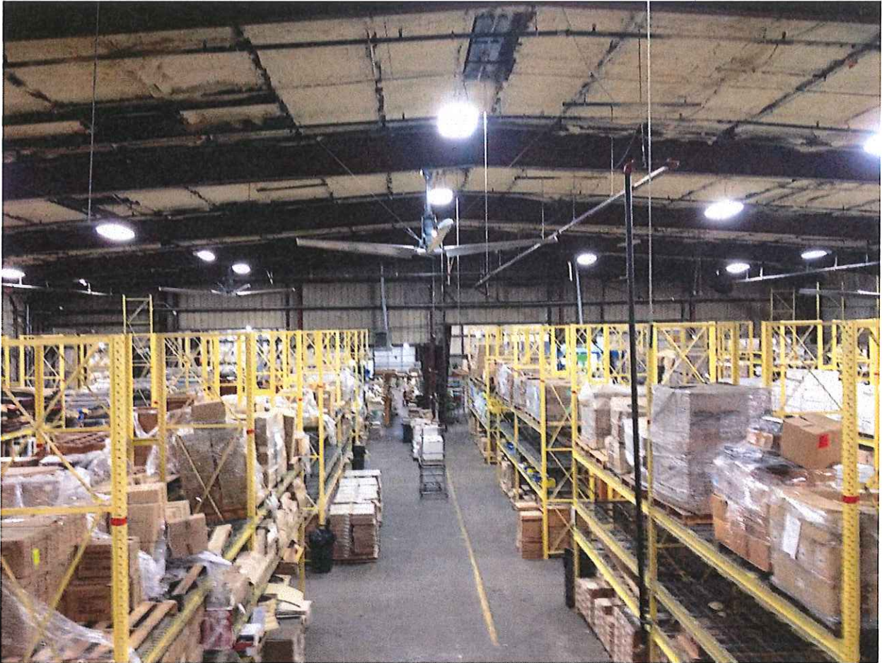
Fans: The fans have been installed; electrical connections are still in process.