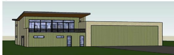
5 WEST ELEVATION SCALE: NTS