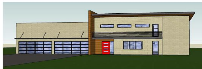
2 EAST ELEVATION SCALE: NTS