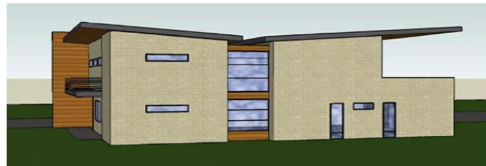
3 NORTH ELEVATION SCALE: NTS